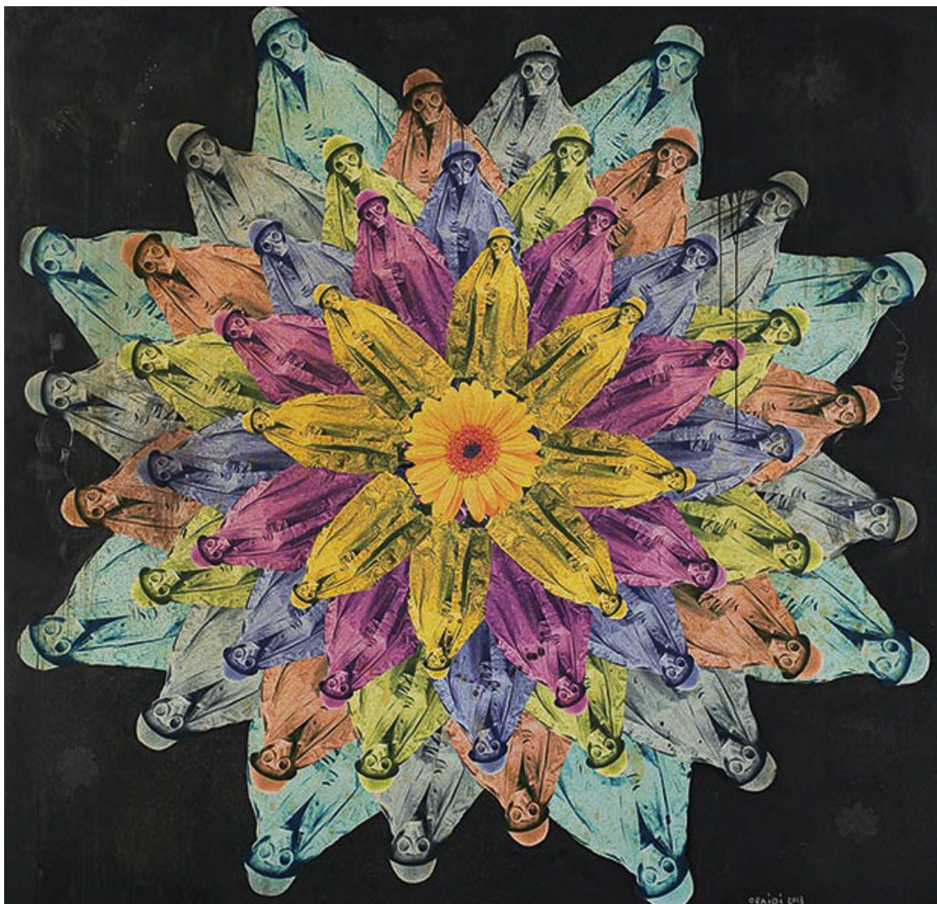
Mahmoud Obaidi (Iraq), Morpheus and the Red Poppy 2 , (2013)

How swiftly the wealthy turned from the language of ‘democracy promotion’ to the language of law and order, sending in the police and the F-16s to clear out public plazas and to threaten countries with bombardment and with coup d’états.