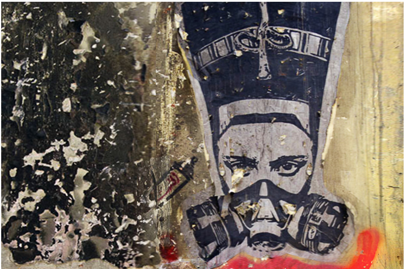
El Zeft (Egypt), Nefertiti in a Gas Mask , 2012.