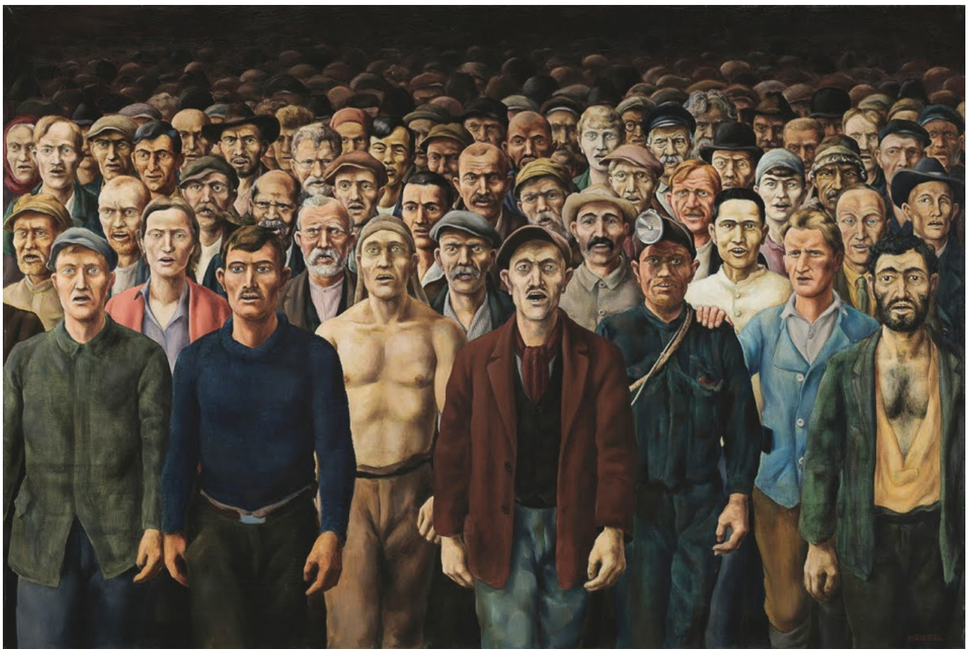
Otto Griebel (Germany), The Internationale , 1929/30.

'What you do yourself is individual', Sandburg writes in a plainspoken style that would be familiar to Jadue. 'What you do or with or for others is social. Get the distinction, Bill? Well, paste it in your hat and fasten it in your memory. But don't lose it. If I can get you to keep in mind this difference between what is social and what is individual, I'll hammer you into a Socialist'. Neoliberal policy makes it harder to experience society in a civil manner. If people have a hard time getting a job, or if jobs themselves are more stressful, or if commute times increase, it is easy to expect tempers to fray. If medical care is hard to attain, if pensions deteriorate before higher expenditures (including taxes), and if it just gets harder to deal with everyday life, then anger will rise, and a general social misery will come out on display.