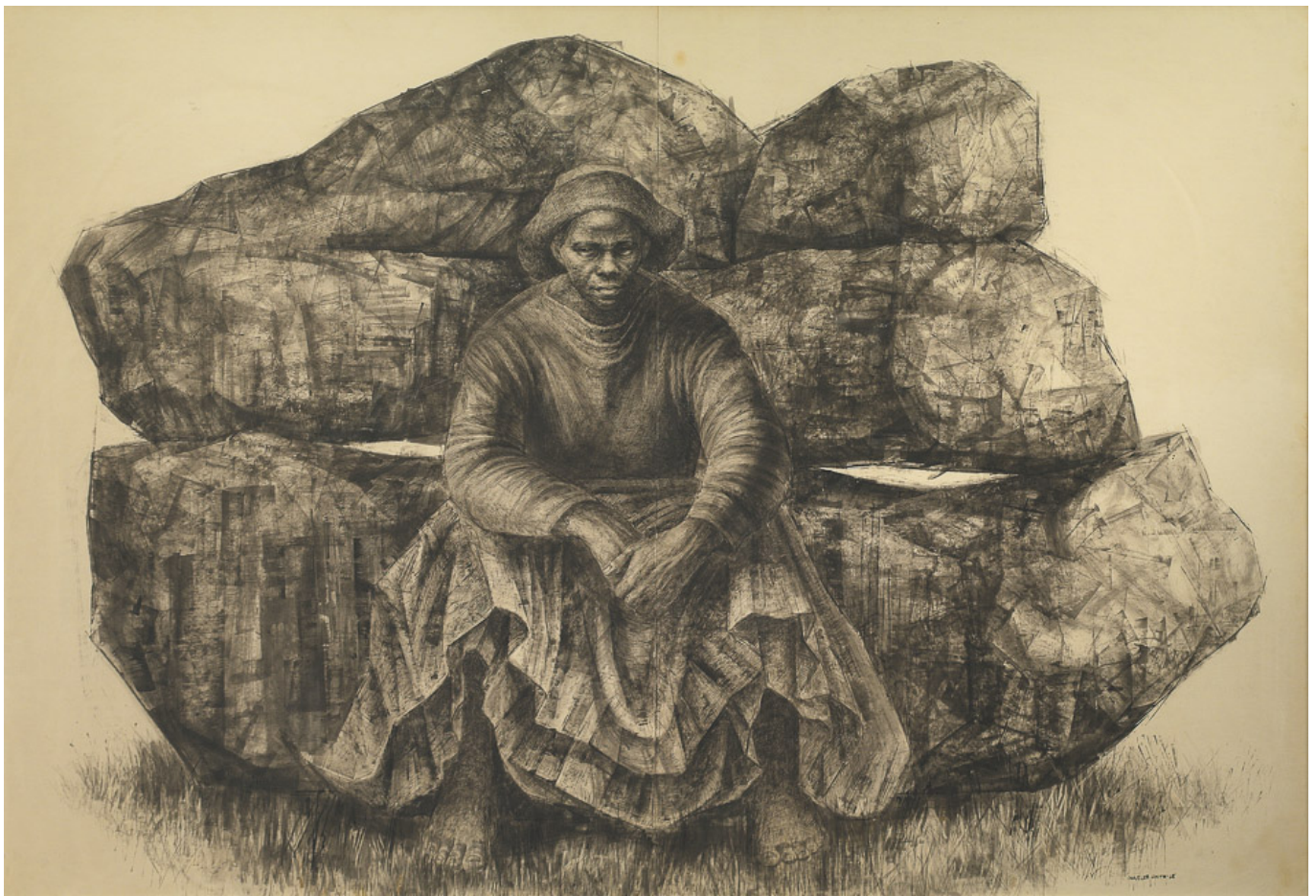
Charles White (USA), General Moses (Harriet Tubman) , 1965.

If this rational policy not only provides care for the poor and saves the municipality money, I ask him, why don't other municipalities follow the Recoleta model? 'Because they are not interested in the well-being of the people', Jadue tells me. 'Capitalism', Jadue says, 'creates the poor', and the poor then come to ask for goods and services from the state due to their relative powerlessness. 'The poor are more honest than the rich. If the poor can buy goods and services at a just price, then they don't ask for money'.