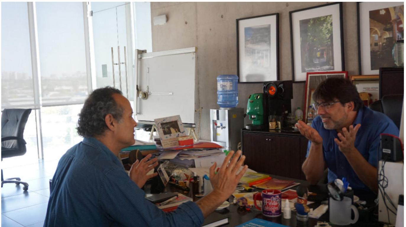
Daniel Jadue speaks to Vijay Prashad.