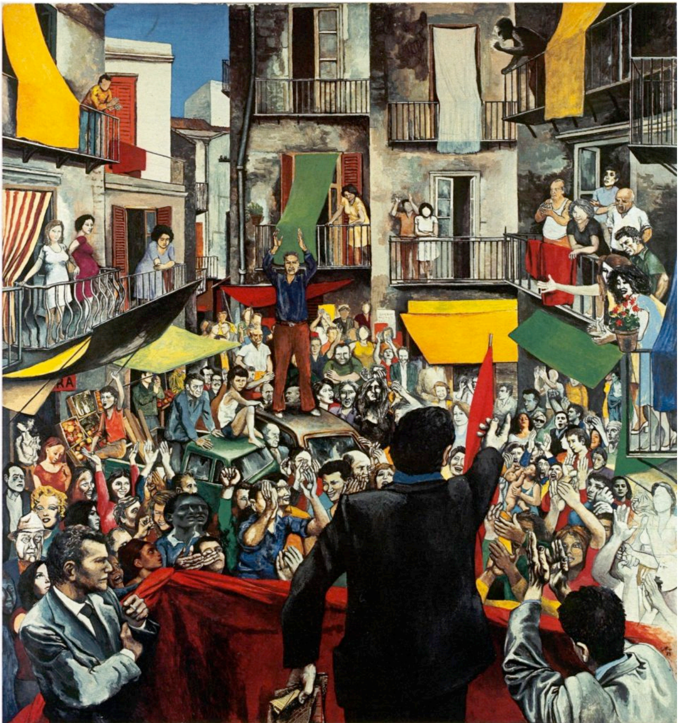
Renato Guttuso (Italy), Comizio di quartiere , 1975.

Trained as an architect, Jadue has a clear sense of long-term planning. In 2001, he tells me, the communists in Recoleta developed a strategic plan to win the mayor's office by 2012. At that time, the extreme right