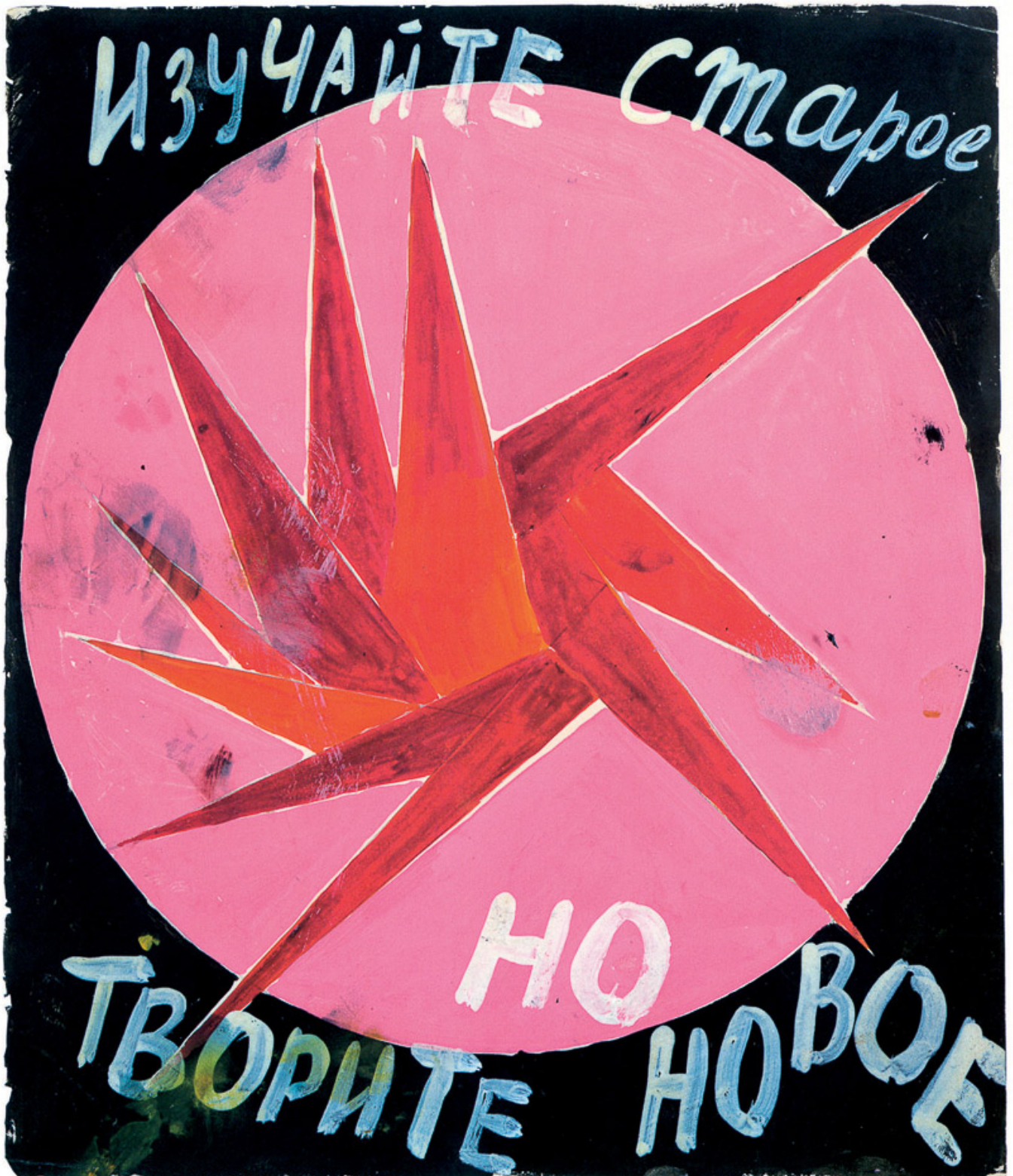
Varvara Stepanova (USSR), Study the Old, but Create the New , 1919.