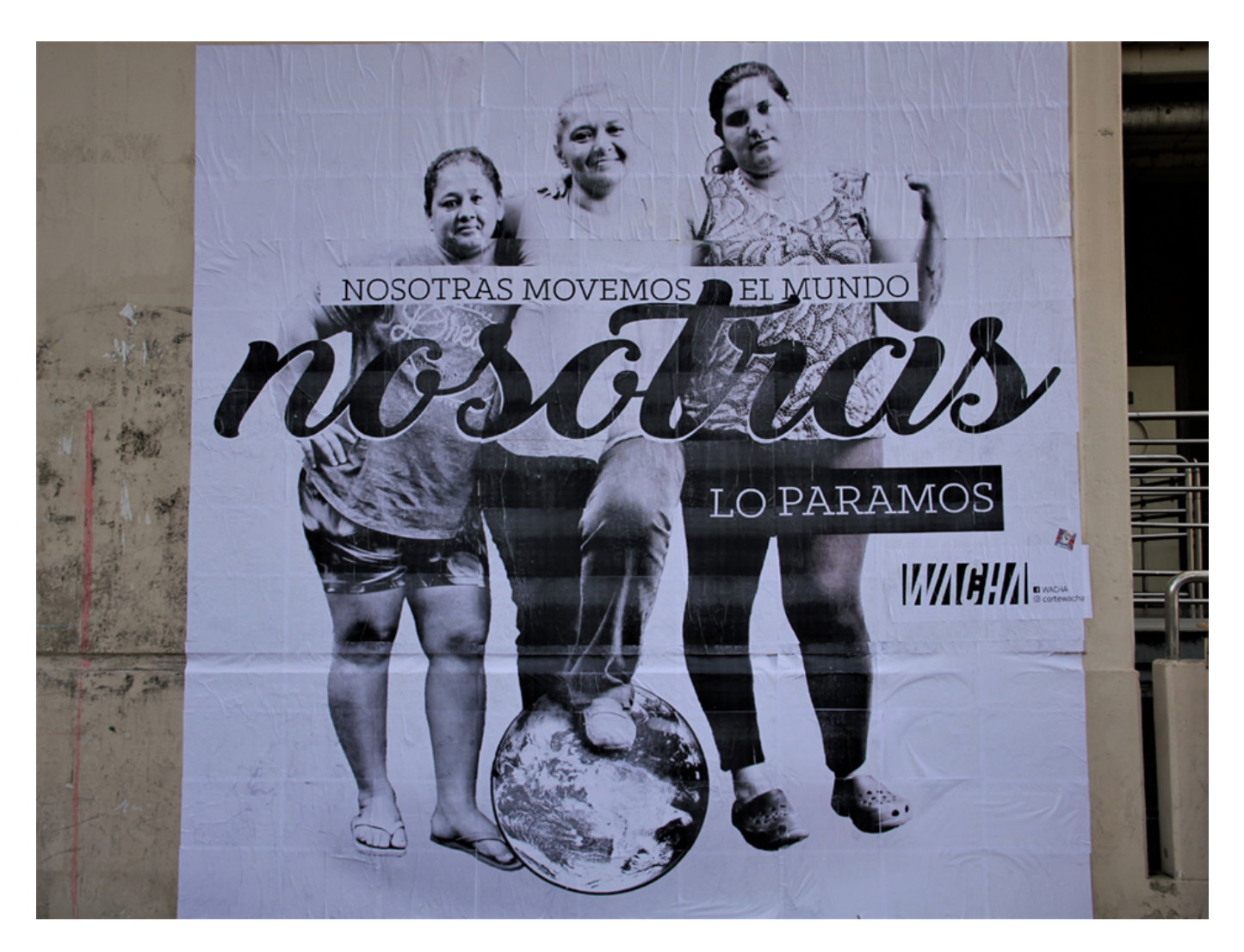
'We move the world, we stop it', an intervention that took place during the 8M March based on a photograph taken of comrades from the Movement of Excluded Workers, La Plata, Argentina.

partner, helping an older person to take a bath, carrying out health check-ups, or teaching young children'. The second is characterised by indirect care activities, 'which do not entail face-to-face personal care, such as cleaning, cooking, doing the laundry and other household maintenance tasks (sometimes referred to as "non-relational care" or "household work"), that provide the preconditions for personal caregiving'. Direct and indirect care work operate in tandem, the physical and emotional labour that holds together the fabric of society.