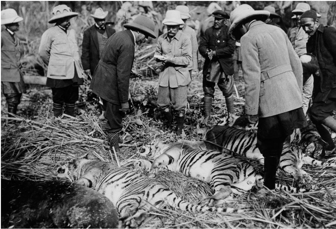
‘International Community’, 1911.

The casual use of the phrase ‘international community’ got us thinking: are there other phrases such as this that are wielded to shape how the world sees things? What are the keywords of the powerful? Our team came up with a number of such phrases, and this list will become – eventually – a full scale Phrasebook of Imperialism . For now, however, please enjoy a taste of our Phrasebook –