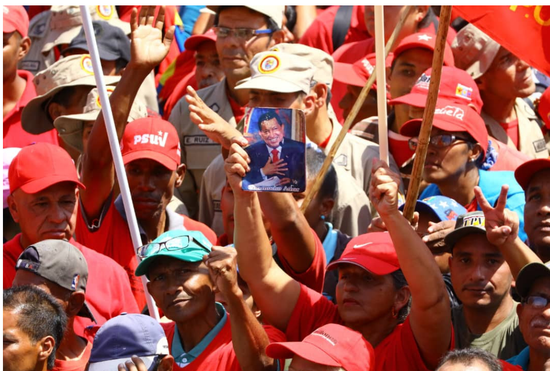
Demonstration to defend the Bolivarian Revolution in Caracas on 2 February 2019.

The epicentre of that pitched battle is now in Venezuela. Two quick points need to be made: