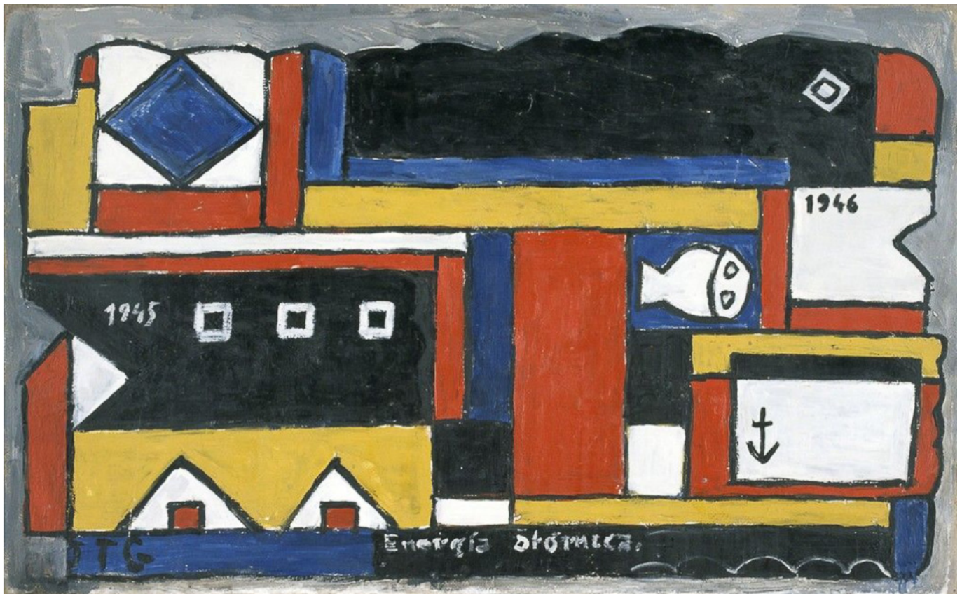
Joaquín Torres García (Uruguay), Energía Atómica (Atomic Energy) , 1946.