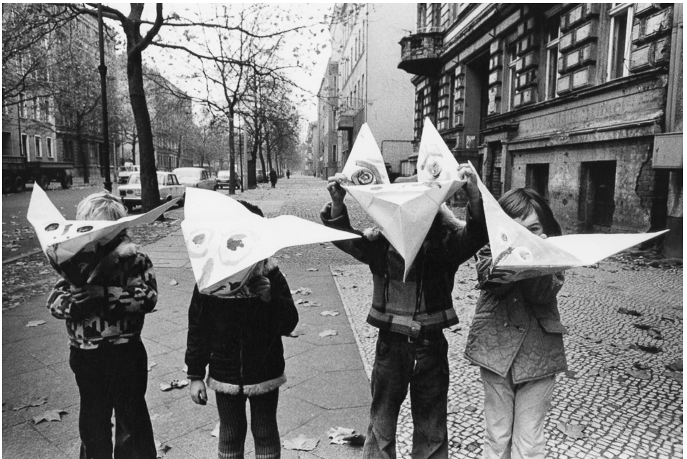
Roger Melis (DDR), Kinder in der Kollwitzstraße ('Children in Kollwitzstraße'), 1974.

Not all infections can be prevented by vaccines. Despite huge financial investments, we still do not yet have (and may never have) dependable vaccines for certain infectious diseases – such as HIV-AIDS and malaria – due to these diseases’ biological complexity. It has been possible for COVID-19 vaccines to be rushed into use because – for the most part– they are based on well-understood biological mechanisms in less complex disease situations. Vaccines are an important measure to contain infectious epidemics. However, genetic changes in the infectious microbe can make vaccines ineffective and necessitate development and deployment of new vaccines.