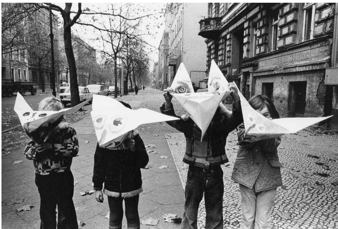
Roger Melis (DDR), Kinder in der Kollwitzstraße ('Children in Kollwitzstraße'), 1974.

Not all infections can be prevented by vaccines. Despite huge financial investments, we still do not yet have (and may never have) dependable vaccines for certain infectious diseases – such as HIV-AIDS and malaria – due to these diseases’ biological complexity. It has been possible for COVID-19 vaccines to be rushed into use because – for the most part– they are based on well-understood biological mechanisms in less complex disease situations. Vaccines are an important measure to contain infectious epidemics. However, genetic changes in the infectious microbe can make vaccines ineffective and necessitate development and deployment of new vaccines.