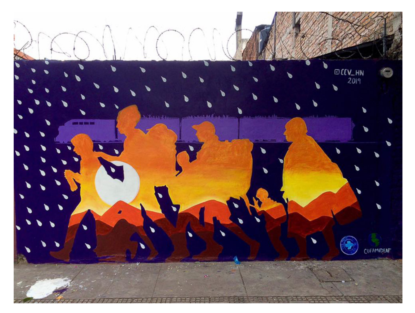
Colectivo Culturas Vivas, Senderos latinos / Latino paths, Honduras, 2019