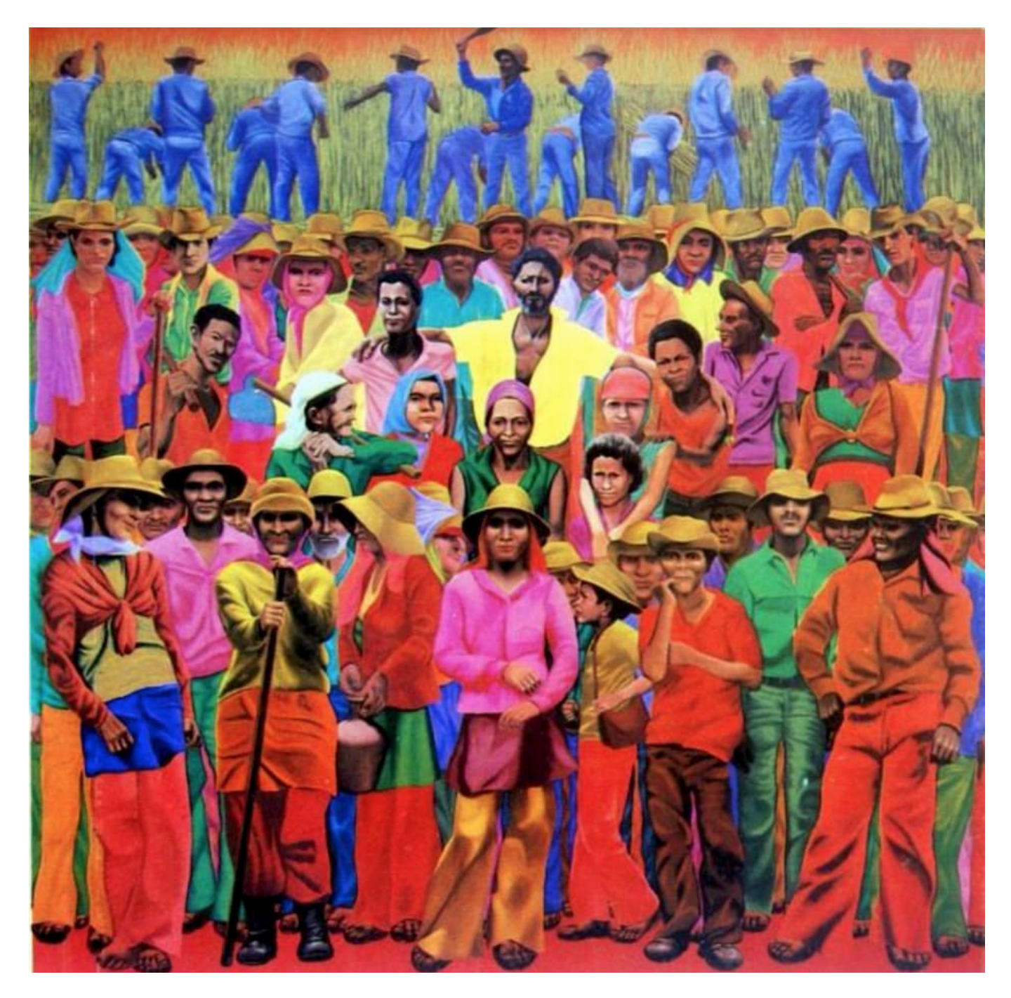
Gontran Guanaes Netto, O povo da terra dos papagaios (The people of the land of the parrots), 1982