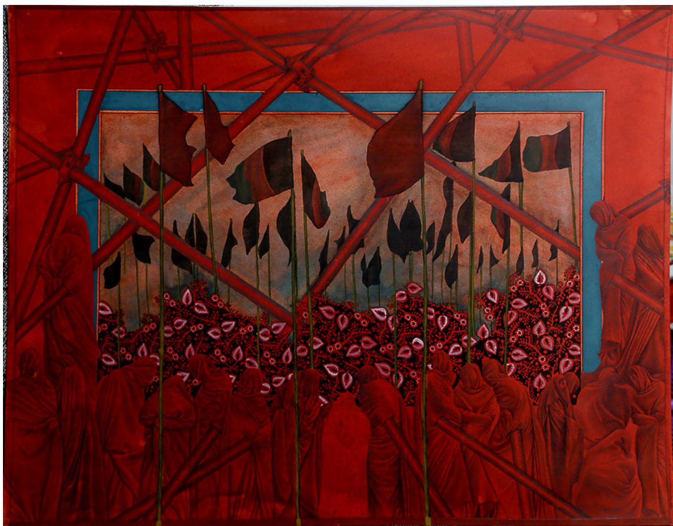
Mohsen Taasha Wahidi (Afghanistan), Rebirth of the Red , 2017.