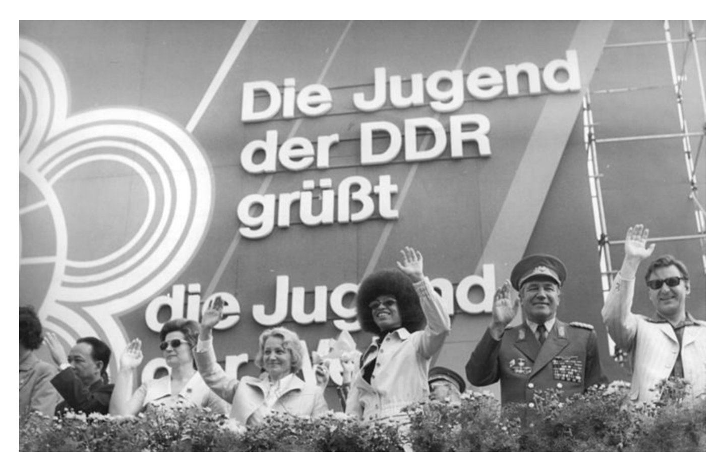
The Free German Youth, a member of the World Federation of Democratic Youth, hosted the Tenth World Festival of Youth and Students in Berlin, 1973.

Organisations such as the Federal Foundation for the Study of Communist Dictatorship in East Germany (Berlin) and the Victims of Communism Memorial Foundation (Washington, United States) exist not only to denigrate the communist past and to malign communism, but also to make sure that communist projects in the present carry the penalty of their caricatures. To advance a left project in our time – which is imperative – is made much more difficult if it must carry the albatross of anti-communist fabrications on its back. That is the reason why this project, led by IF DDR, is so important. It is not merely an argument about the DDR; it is also, at its core, a broader argument about the possibilities opened by experiments to create a socialist society and the material improvements they create, and have created, in the lives of the people.