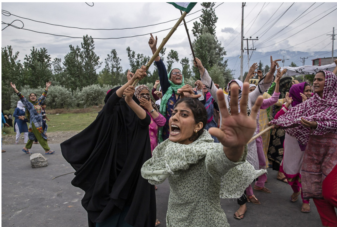
Srinagar, Kashmir, 9 August 2019.