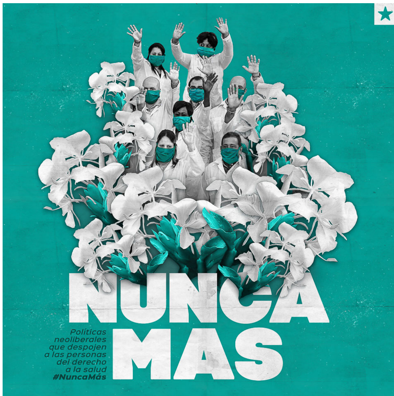
Kalia Venereo (Dominio Cuba), Nunca Más , 2020.