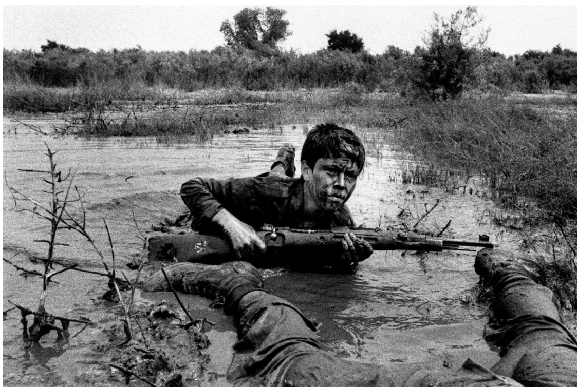
Iran-Iraq War (1980-1988).

Iran could now stretch out in both directions. Towards the east, Iran deepened its links to various forces in Afghanistan and developed close ties with China. Towards the west, Iran's old links to Iraq, Syria and Lebanon strengthened. It was in order to confine Iran to its borders and limit its influence in the region that the United States pushed for regime change in Syria in 2004, pushed for its Iraqi allies to win the two parliamentary elections of 2005, pushed for the Israeli war on Lebanon in 2006, and pushed for use of the nuclear issue to sanction Iran from 2006.