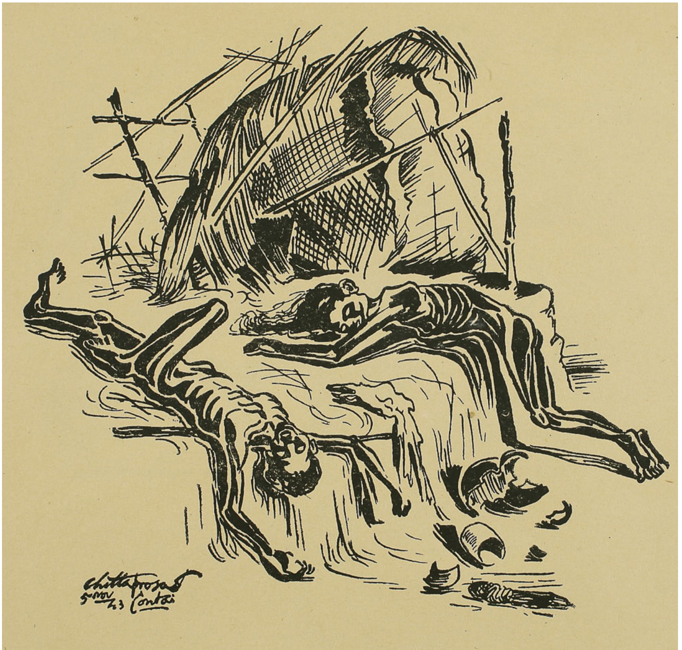
Chittaprosad, Hungry Bengal, 1943.

If you listen to agricultural workers, farmers, and social movements around the world, you will find that they have lessons to teach us about how the system should be reorganised during this crisis. Here is a little bit of what we have learnt from them. It is a mix of emergency measures that can be immediately implemented and more long-term measures that can build towards sustained food security, and then food sovereignty – in other words, popular control over the food system.