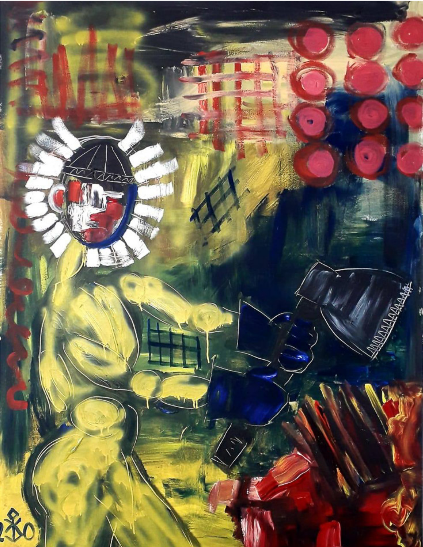
Kanat Bukezhanov, Coronavirus, 2020.