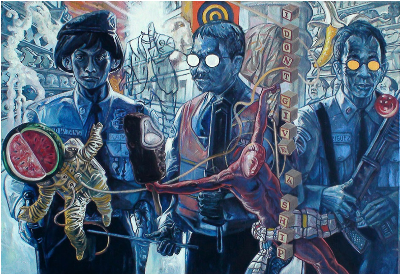
Jose Tence Ruiz, The Pro-Rated Wage of the Abang Guard , 2011.

capital seeks to profit. When modest food distribution programmes are implemented to stave off widespread famine, they often function as state subsidies for a food system captured, from the corporate farm to the supermarket, by capital.