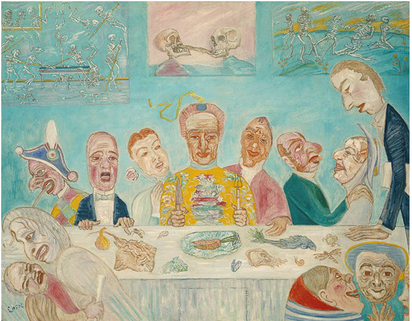
James Ensor, Comical Repast (Banquet of the Starved) , 1917-18.

The old English reverend Thomas Malthus was wrong when he wrote that, for eternity, food production would grow arithmetically (1-2-3-4) and that populations would grow geometrically (1-2-4-8), with the needs of the population easily outstripping the ability of humans to produce food. When Malthus wrote his treatise in 1789, there were about a billion people on the planet. There are now almost eight billion people, and yet scientists tell us that more than enough food is produced to be able to feed everyone. Nonetheless, there is hunger. Why?