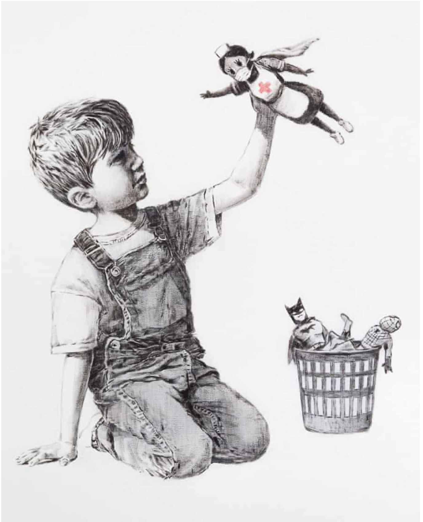
Banksy (unknown), Game Changer, 2020.