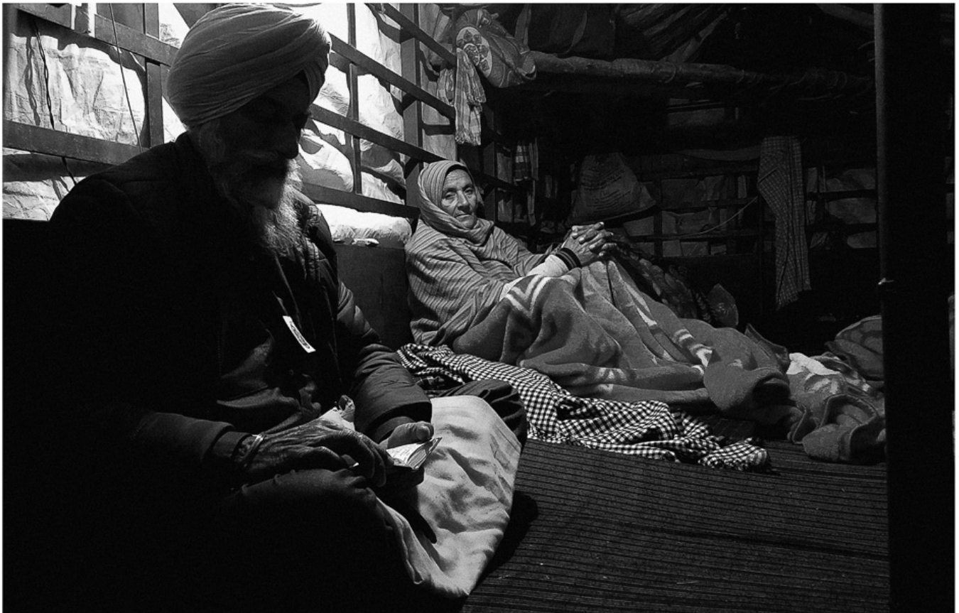
A farmer couple spends a winter night in their trolley at the Singhu border in Delhi, 28 December 2020.

The farmers braved the Indian winter with defiance. What provoked them was the passage of three laws in September 2020 that delivered Indian agriculture firmly into the hands of a small group of mega-corporate houses. The Samyukta Kisan Morcha [United Farmers' Front], made up of over forty farmer and agricultural workers' unions, has called for the protest in June. Their slogan for that protest, Kheti Bachao, Loktantra Bachao [Save Farming, Save Democracy], sums up the farmers' struggle.