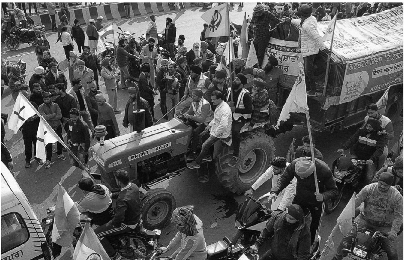
A tractor contingent on GT Karnal Road breaks through barricades and enters Delhi, beginning a confrontation between protestors and the police in Delhi, 26 January 2021.

The 2011 Census says that 833.1 million people out of a population of 1.2 billion live in rural India, which means that two in three Indians live in the countryside. Not all of them are farmers or agricultural workers, but all of them are in one way or another connected to the vitality of the rural economy. There are artisans and weavers, forestry workers and carpenters, miners and industrial workers. An entire social world premised on a sustainable and healthy agricultural economy is in danger of being wiped out. This is what the farmers know: that the capitalist attack will undermine the existence of India’s rural workers and their ability to feed the country’s growing urban population.