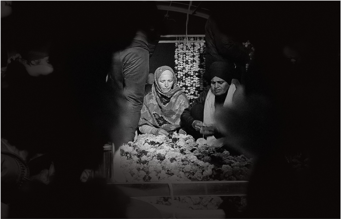
Women decorate a palki sahib , a Sikh religious structure at the Singhu border in Delhi, 31 December 2020.

Modi cannot easily back down from his commitment to mega-corporations, and the farmers and agricultural workers cannot surrender their lives. The stand-off has no easy exit. Large sections of the urban public are sympathetic to those who feed them. The application of force, often masked under the pretext of enforcing the lockdown, has been attempted, but it has failed. Will Modi's government risk using greater force? If it does, will the public tolerate it? There is no easy answer to these questions.