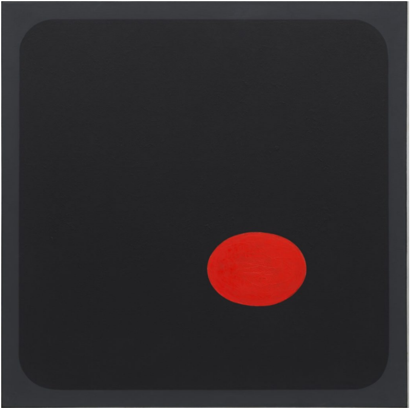
Elsa Gramcko (Venezuela), R-33 Todo comienza aqui ('R-33, It All Begins Here'), 1960.

The United Nations Charter (1945) permits the Security Council to authorise sanctions under chapter VII, article 41. However, it emphasises that these sanctions can only be implemented by way of a UN Security Council resolution. That is why US sanctions on Venezuela, which were first imposed in 2005 and have deepened since 2015, are illegal. As UN special rapporteur on unilateral coercive measures Alena F. Douhan wrote in her 2022 report , these unilateral measures are prone to overcompliance and secondary sanctions as a result of countries' and firms' fear of being punished by the US. The illegal measures imposed by the US have resulted in tens of billions of dollars of losses since 2015 and have served as collective punishment against the Venezuelan population ( forcing over six million of them to leave the country). In 2021, the Venezuelan government formed the Group of Friends in Defence of the UN Charter to bring countries together to