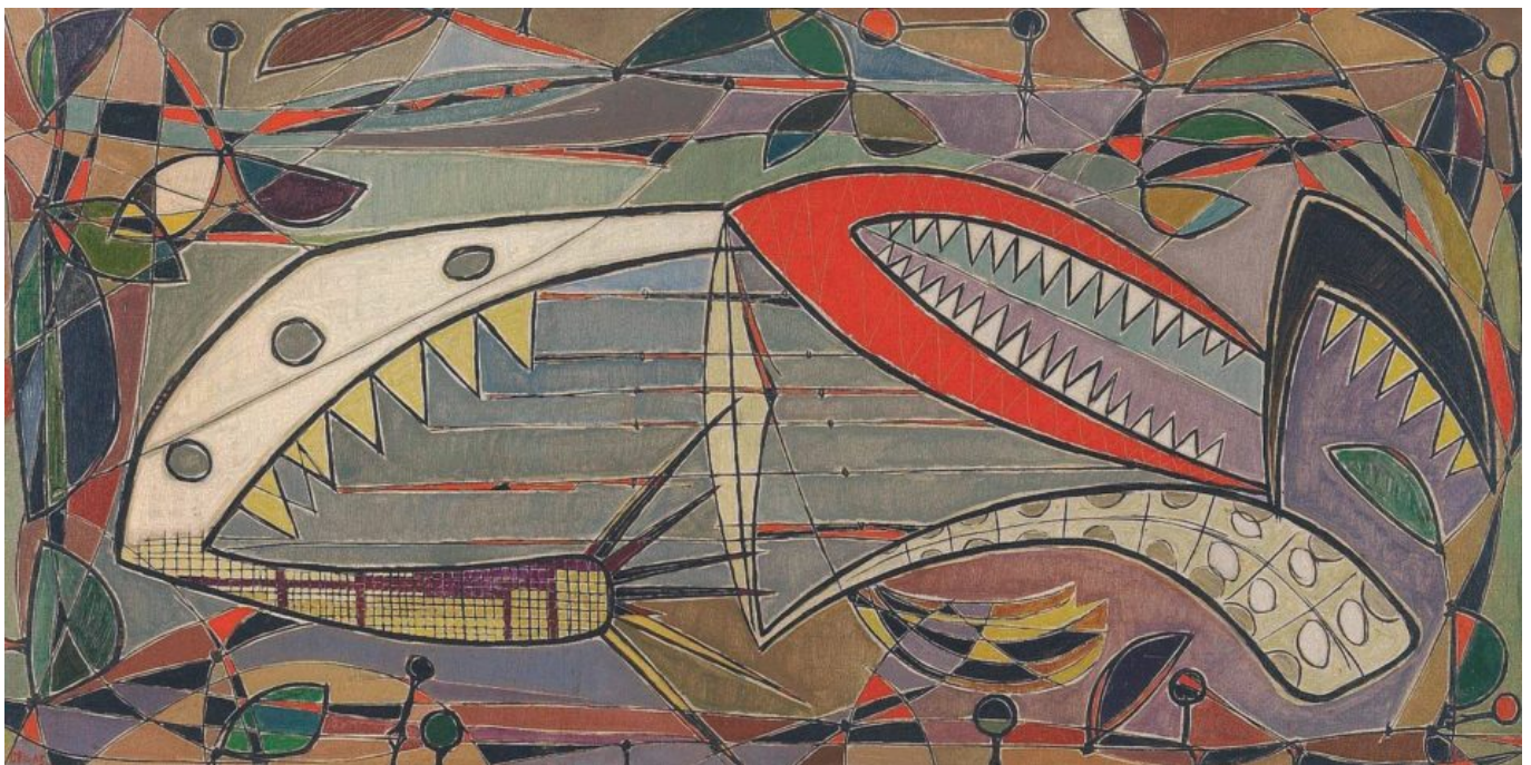
Oswaldo Vigas (Venezuela), Alacrán ('The Scorpion'), 1952.

Under the new constitution, Venezuela’s old Supreme Court – which the country’s oligarchy had used as a mechanism to prevent any major social changes from taking place – was replaced by the Supreme Tribunal of Justice ( Tribunal Supremo de Justicia ) or TSJ. Over the course of the past quarter century, the TSJ has been disturbed by several controversies, largely stemming from interventions of the old oligarchy, which refused to accept the major changes that Chávez pushed through in his early years. Indeed, in 2002, the judges on the TSJ acquitted the military leaders who attempted a coup d’état against Chávez, an act which outraged the majority of Venezuelans. This ongoing interference eventually led to the expansion of the bench (as US President Franklin D. Roosevelt had done in 1937 for similar reasons) as well as more legislative control over the judiciary, as exists in most modern societies (such as in the United States, where Congressional oversight of the courts is institutionalised through instruments such as the ‘exceptions clause’). Nonetheless, this conflict over the TSJ provided an early weapon for Washington and the Venezuelan oligarchy as they attempted to delegitimise the Chávez government.