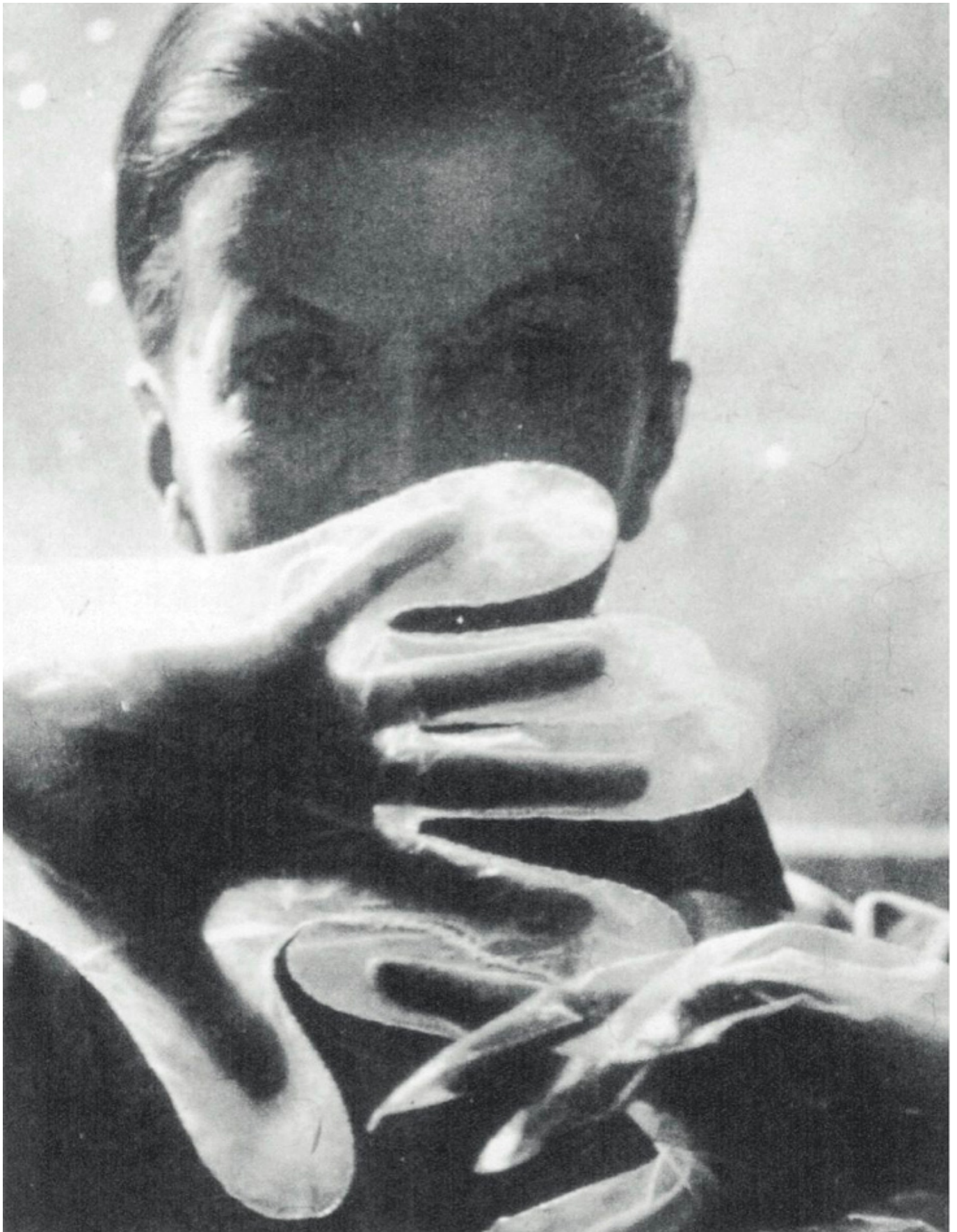
Lygia Clark (Brazil), Nostalgia do corpo (' Nostalgia of the Body '), 1964.