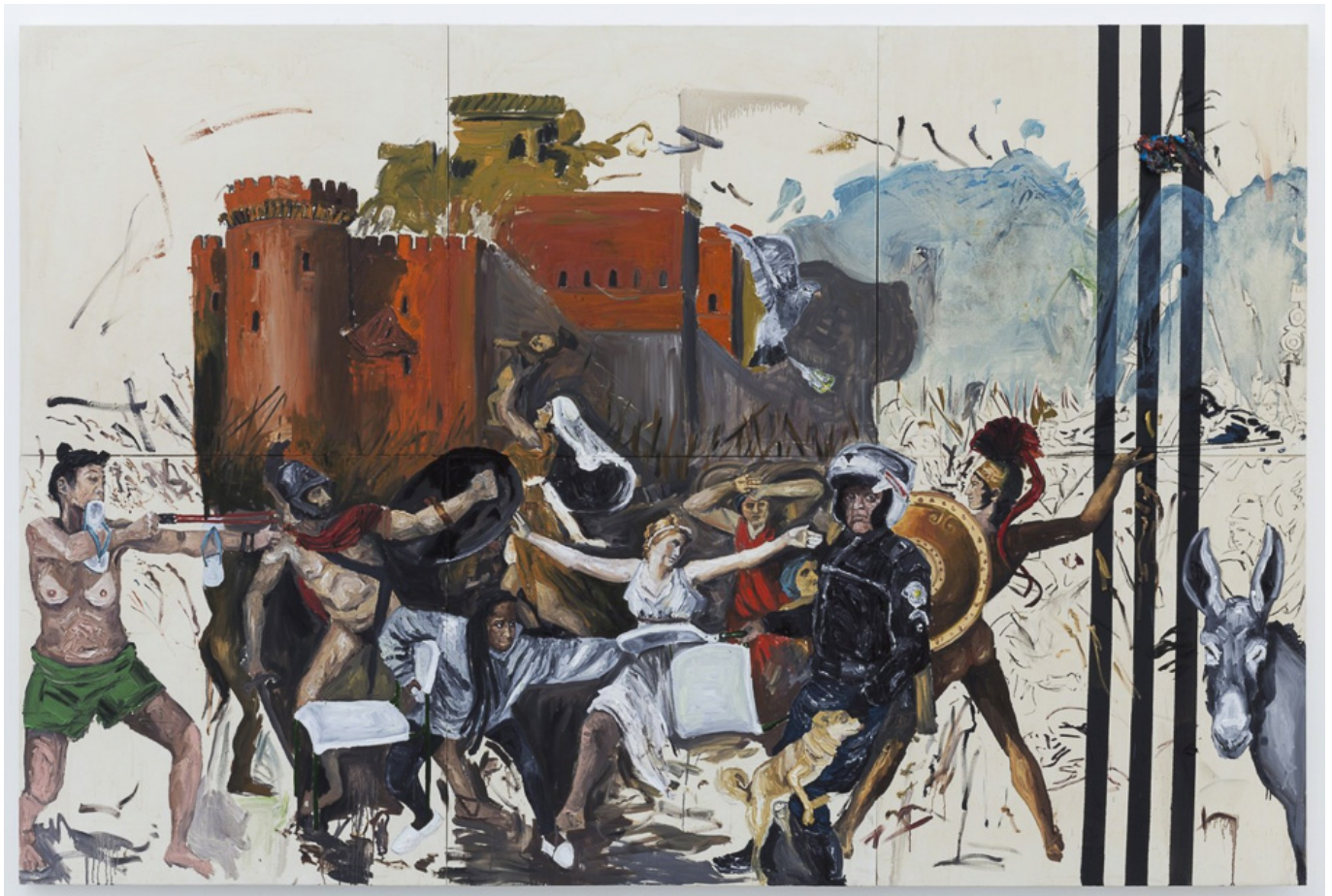
Camila Soato (Brazil), Ocupar e resistir 1 ( ‘Occupy and Resist 1 ), 2017.

high, and the death count grows steadily. It appears that a million people are now infected in Brazil (out of a population of over 211 million). In India, it is difficult to even estimate the number of those infected, since the testing levels are so low, and the data is so poor. One suggestion is that at least eight million people have been infected (out of a population of over 1.3 billion).