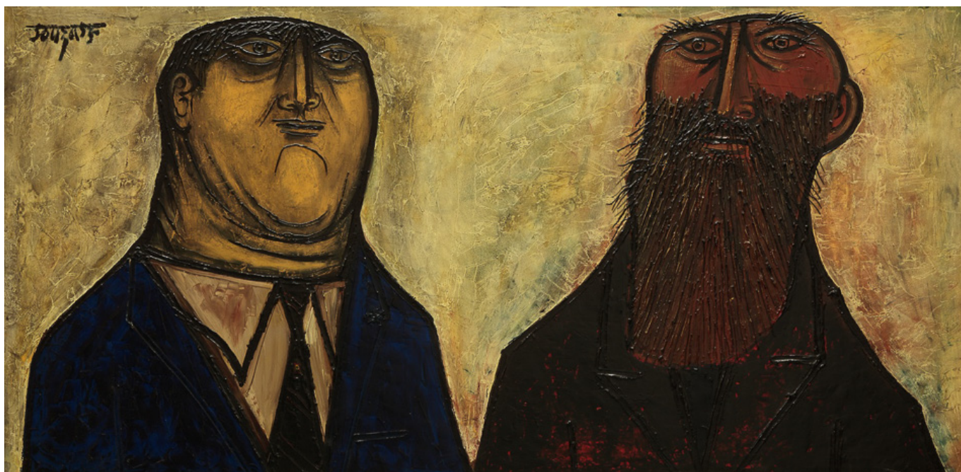
FN Souza (India), Tycoon and the Tramp , 1955.

Disregard for the people marks the dangerous incompetence of the governments of Bolsonaro and Modi. Bolsonaro's cavalier attitude towards the highly contagious nature of the virus has meant that there has not been a well-crafted lockdown of the country; as Bolsonaro began to campaign to completely reopen the country, the mayor of São Paulo, Bruno Covas, accused Bolsonaro of playing 'Russian roulette' with the population.