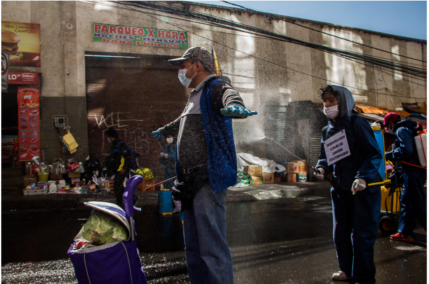
Shoppers at the market pay to be disinfected. Rodríguez Market, La Paz, Bolivia, 2020.

topic we have approached in our twentieth newsletter of this year.