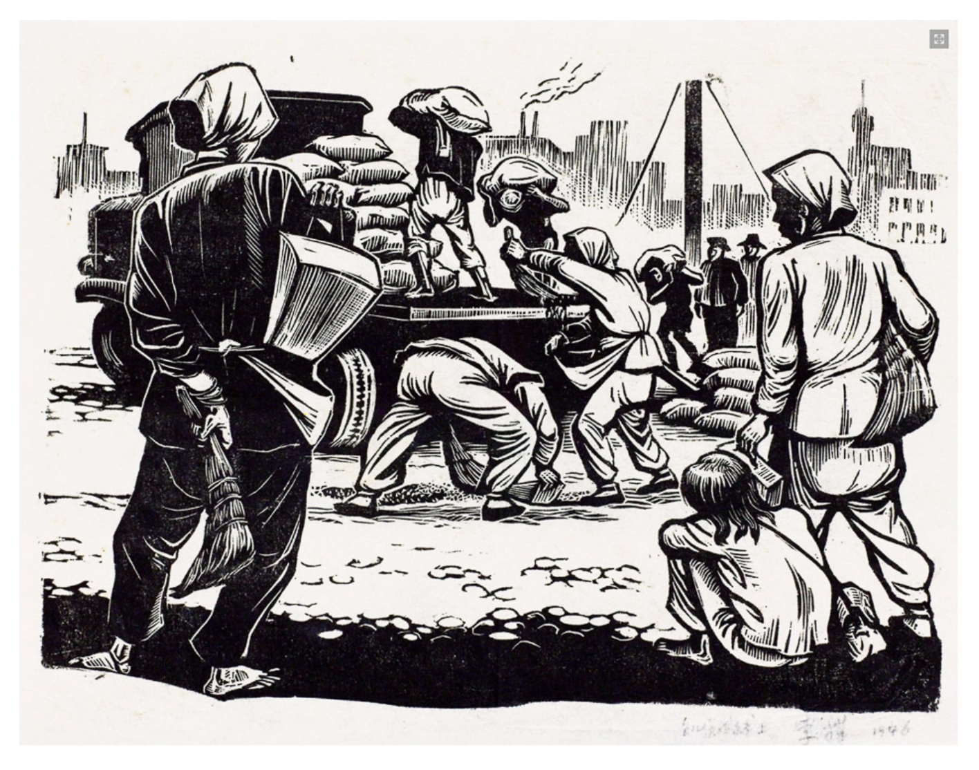
Li Hua (China), Verge of Starvation, 1946.

The debt of these countries is simply not allowing them to properly tackle the three pandemics: coronavirus, unemployment, and hunger.