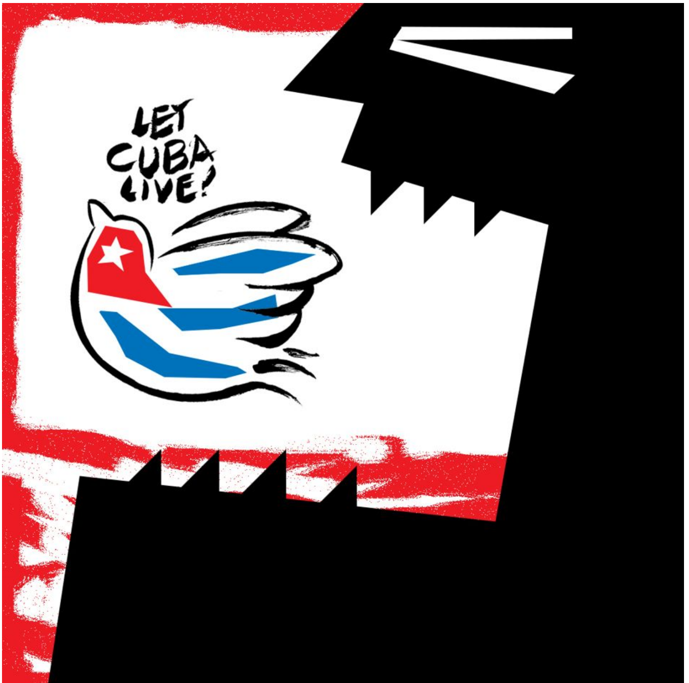
Uttam Ghosh (India), Let Cuba Live , 2021.