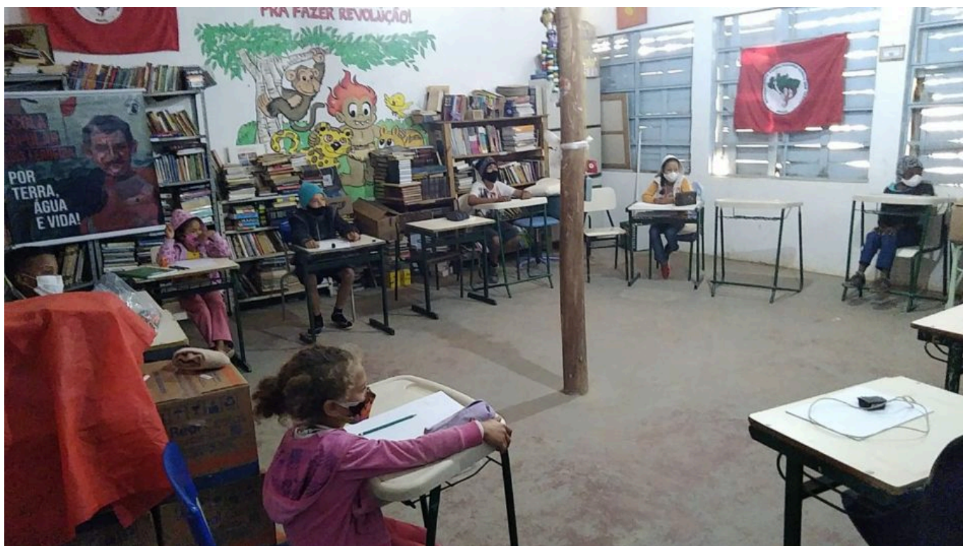
After-school classroom in Camp Marielle Franco, 2021