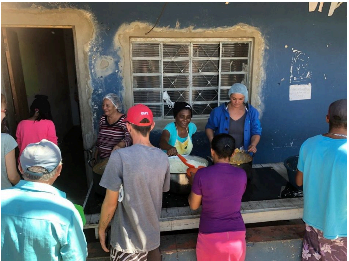
Community kitchen at Camp Marielle Vive, 2019

Camp Marielle Vive is not an ordinary 'slum', a word with so many negative connotations. The mood in many slums is desolate, criminal gangs and religious organisations providing them with fragile social glue. But Camp Marielle Vive exudes a different aura. Flags of the Landless Workers' Movement (MST) are everywhere. The residents give off a quiet and friendly dignity, many of them wearing t-shirts or caps from their organisation. They have an air of preparation: prepared to defend their camp from eviction by the local authorities and prepared to build a genuine community for themselves.