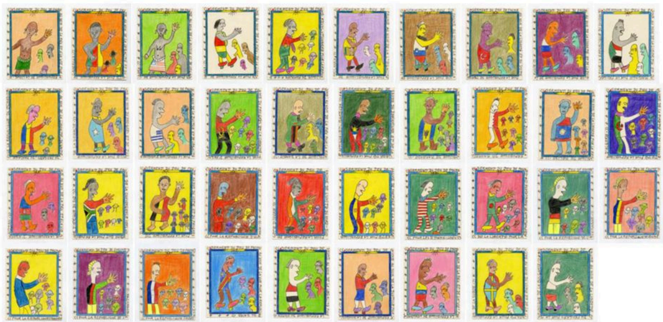
Frédéric Bruly Bouabré (Ivory Coast), Le serment du Jeu de Paume , 2010.

Importantly, the 6th IPCC report shows that ‘historical cumulative CO2 emissions determine to a large degree warming to date’, which means that the Global North countries have already taken the planet to the threshold of annihilation before countries of the Global South have been able to attain basic needs such as universal electrification. For instance, 54 countries on the African continent account for merely 2-3% of global carbon emissions; half of Africa’s 1.2 billion people have no access to electricity, while many extreme climate events (droughts and cyclones in southern Africa, floods in the Horn of Africa, desertification in the Sahel) are now taking place across the continent. Released on World Environment Day (5 June) and produced with the International Week of Anti-Imperialist Struggle , our Red Alert no. 11 further explains the scientific and political dynamics of the climate crisis, the ‘common but differentiated responsibilities’, and what can be done to turn the tides.