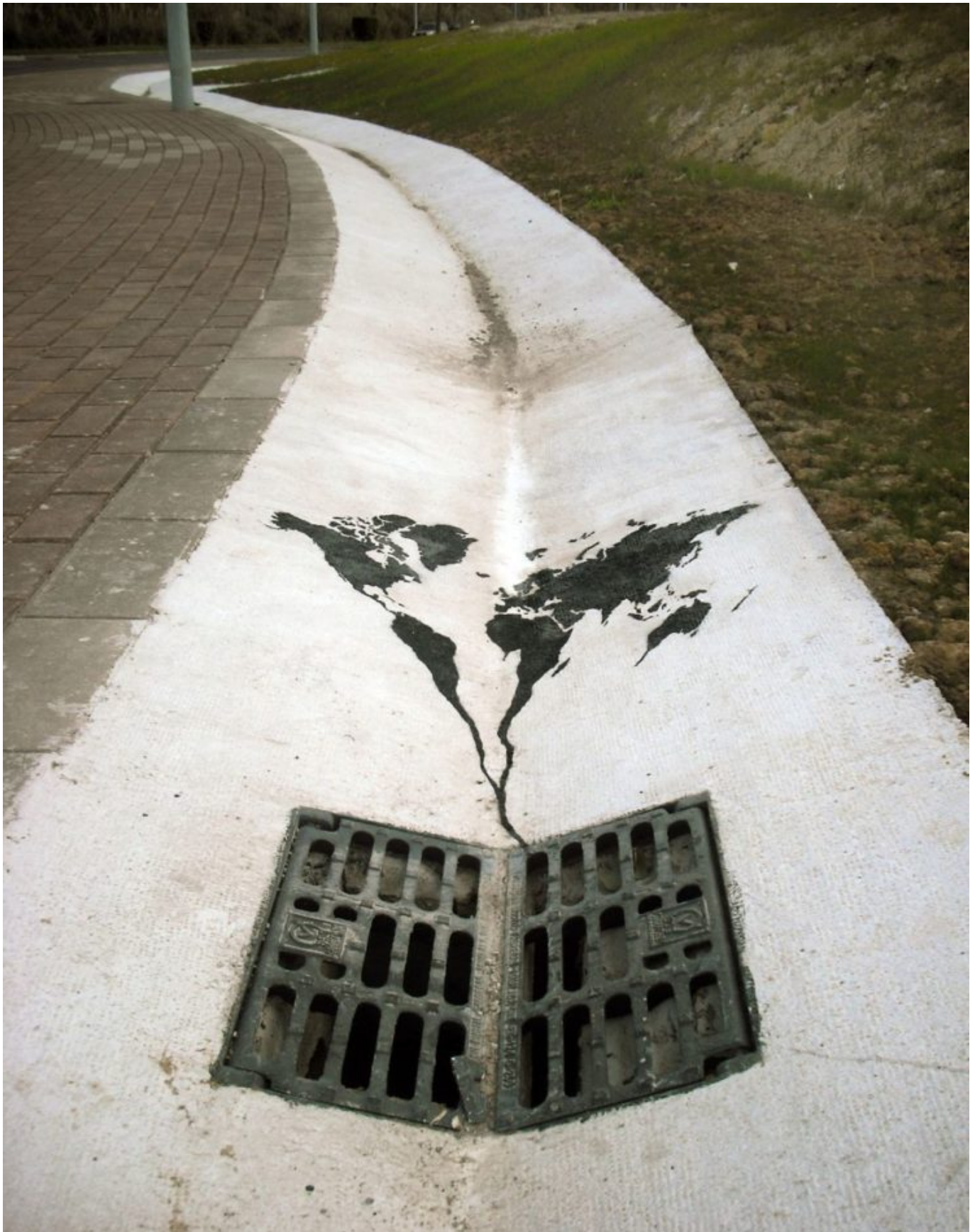
Pejac (Spain), Stain , 2011.