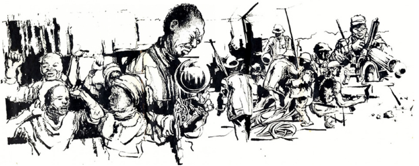
Thami Mnyele (South Africa), untitled, pen and ink, Gaborone, Botswana, 1984.