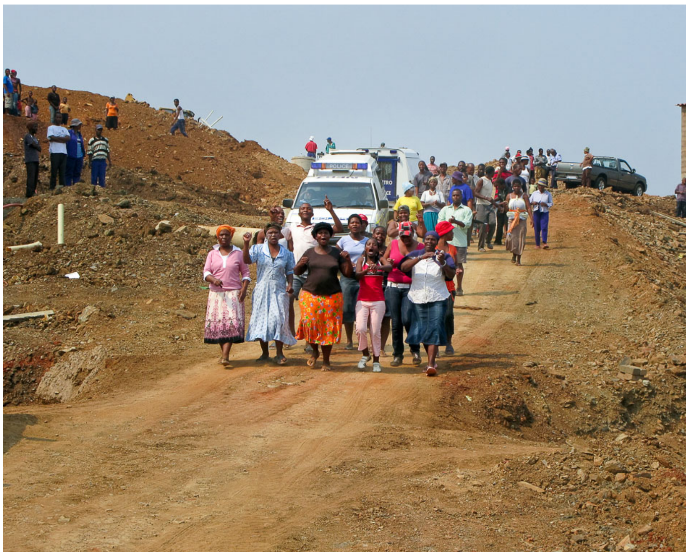
Women protest against evictions and 'relocations' to a new housing development in the Siyanda shack settlement in Durban, March 2009.

A study published in mid-July showed that two out of five adults in South Africa said that their households had lost a main source of livelihood since 27 March 2020 when the lockdown started in the country. The impact that this has on starvation is dramatic, with government policies to shield the population from hunger being minimal. Instead of sending out armed men to tear down the shacks of the people and uproot their farms, it would be far better for a state to work with local structures to arrange the distribution of necessary supplies. This is where things are confusing: the protection of private property is far more important for these states than the protection of precious life. 'Tell the people that the struggle must go on', said Moloise before he was hung inside a cold prison surrounded by jacaranda trees.