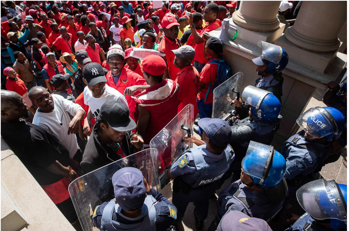
Police barricade the entrance to the City Hall during a march of thousands of members of Abahlali baseMjondolo protesting against political repression, Durban, 8 October 2018.

argues, that in South Africa, ‘the police kill people, the vast majority of them impoverished and black, at a per capita rate that is three times higher than that of the police in the United States’. The numbers are stunning, the range of violence shocking.