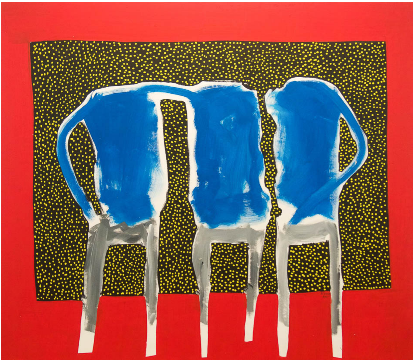
Amadou Sanogo (Mali), Sans-Tete (2016).