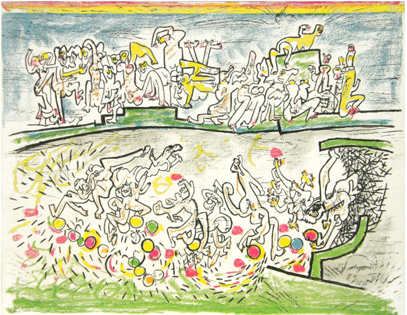
Roberto Matta (Chile), El primer gol del pueblo chileno ('The First Goal of the Chilean People'), 1971.

You cannot eat the UN Charter. But if you learn to read, and if you read the Charter, you can use it to fight for your right to human decency. If we 7.9 billion people came together and decided to form a human chain to advance our human rights – each of us standing three feet apart – we would form a wall that would run for 6.5 million kilometres. That wall would run around the equator 261 times. We would build this wall to defend our right to become human, to defend our humanity, and to defend nature.