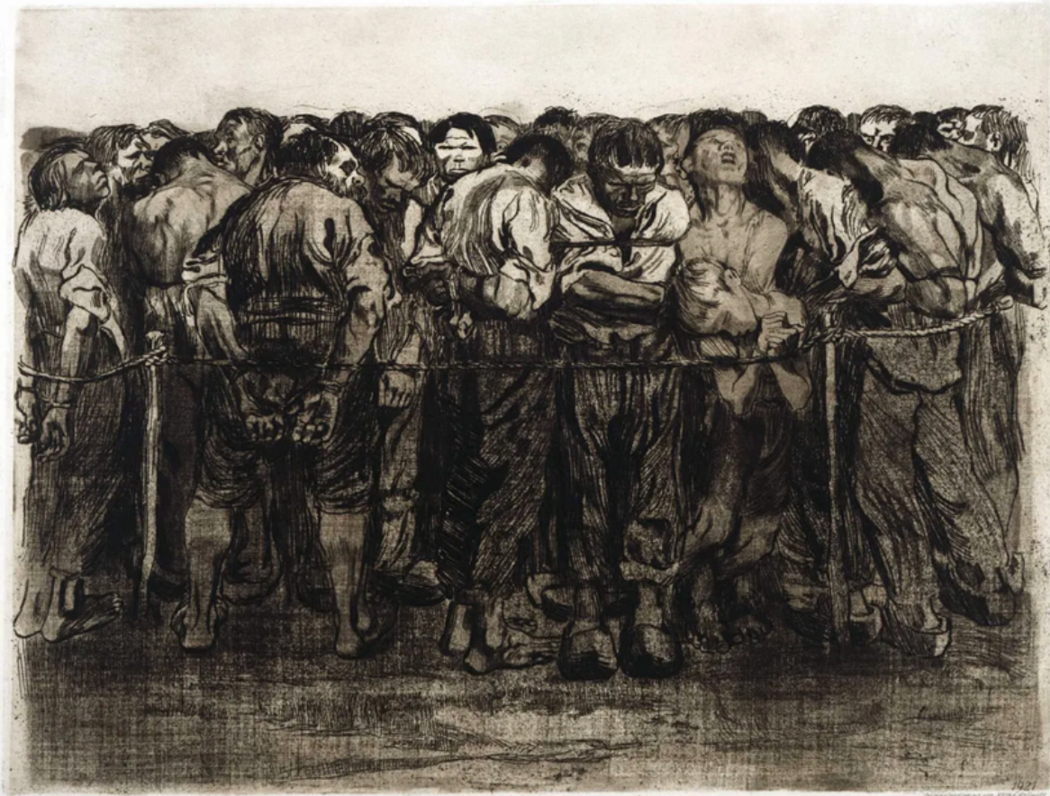
Käthe Kollwitz (Germany), Die Gefangenen ('The Prisoners'), 1908.

During the UN session, 18 countries – led by Venezuela – held a foreign ministers’ meeting of the Group of Friends in Defence of the UN Charter. One in four people who live in the world reside in these 18 countries, which include Algeria, China, Cuba, Palestine, and Russia. The Group, led by Venezuela’s new Foreign Affairs Minister Felix Plasencia, called for ‘reinvigorated multilateralism’. This merely means to uphold the UN Charter: to say no to illegal wars and unilateral sanctions and to say yes to collaboration to control the COVID-19 pandemic, yes to collaboration on the climate catastrophe, yes to collaboration against hunger, illiteracy, and despair.