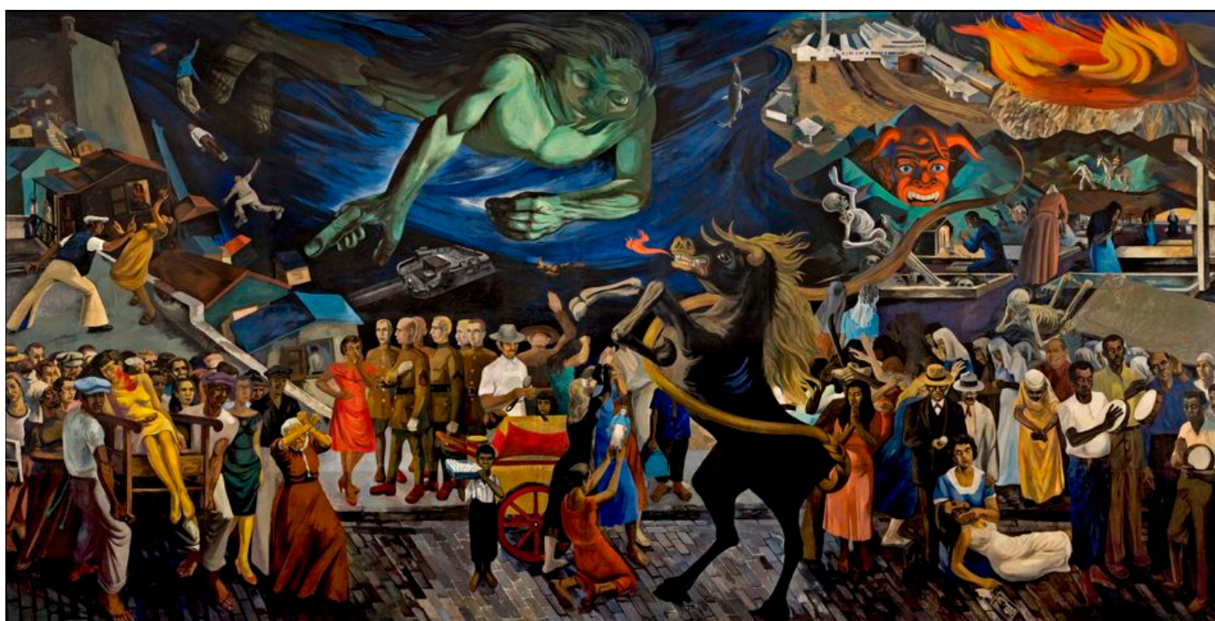
Rafael Tufiño Figueroa (Puerto Rico), La plena , 1952-54.