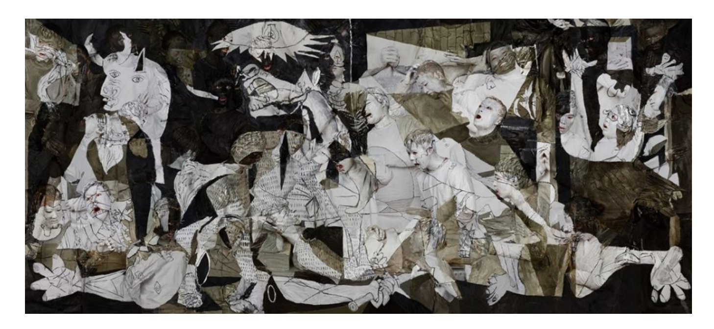
Liu Bolin (China), Guernica , 2016