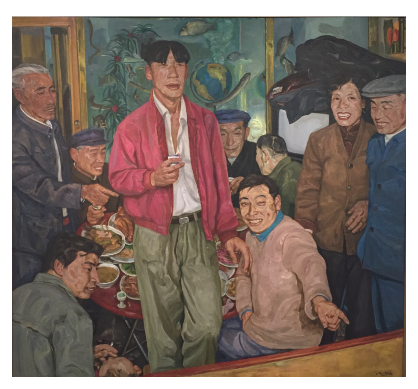
Liu Xiaodong (China), Wedding Party, 1992.

2017 revival of the Quad (Australia, India, Japan, and the US), the creation of the US' Indo-Pacific Strategy (its key document from 2020 is called 'Regain the Advantage'), and the development of a range of new weaponry, including cyberweapons. This military power has come alongside hostile rhetoric against China, with attention focused on Hong Kong, Xinjiang, and Taiwan, and the depiction of the coronavirus pandemic as a 'China virus'. Evidence is not as important here as the use of older racist and anti-Communist ideas to demonise China.