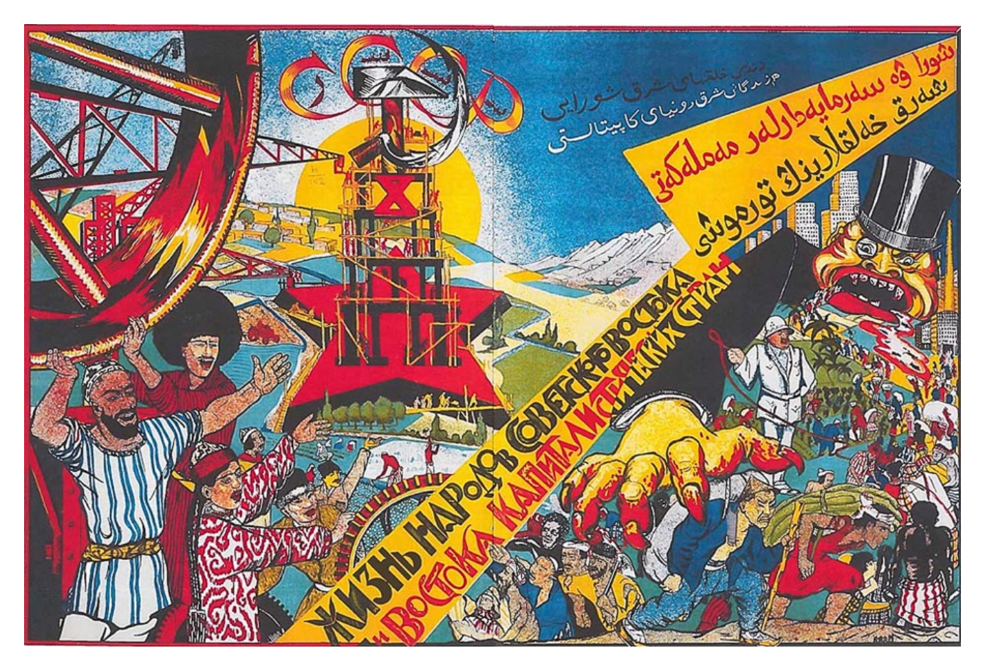
RiaM (USSR), The Life of Peoples of the Soviet and Capitalist East, 1927.

Public health as an idea has a history that goes back through the ages, but early ideas of public health had less concern about the health of the entire public and more about the eradication of disease. If this meant that the poor bore the brunt of it, so be it. This older hierarchical conception of public health remains in our time, particularly in states with bourgeois governments that have a greater commitment to profit than to people. But the socialist idea of public health – that social and state institutions must focus on disease prevention and breaking the chain of infection – grew in force from the 19th century and now comes to the table once more.