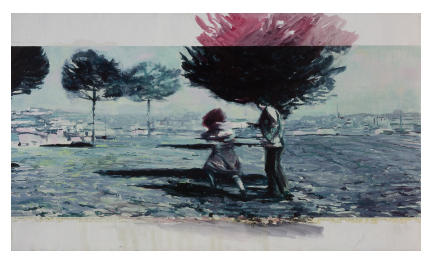
Natalia Babarovic (Chile), The Last Woman on Earth, 2011.

We should all be outraged. But outrage is not a strong enough word.