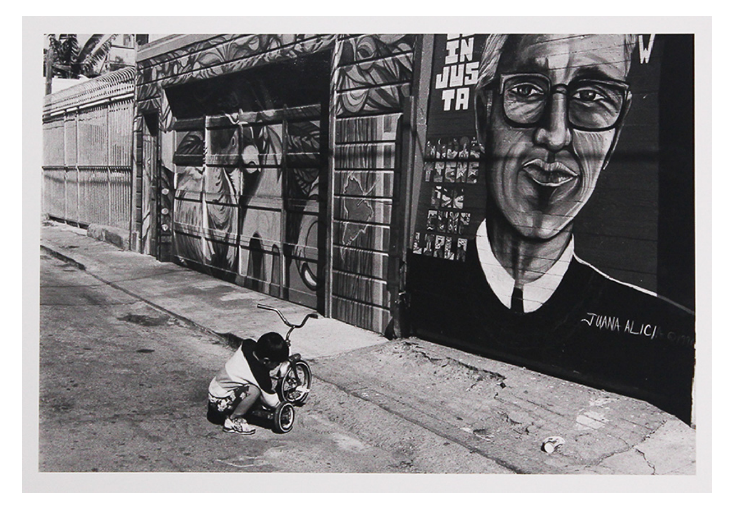
Oweena Camille Fogarty (Mexico), Untitled.

In 2018, a World Bank study showed that half the world's population – 3.4 billion people – live below the poverty line, a number that increased during the pandemic. The Bank used the measure that a person who makes less than $5.50 per day is poor. Over the course of the past half century, states have increasingly privatised the delivery of key social services, such as education, childcare, health care, sanitation, and housing. These social costs are now borne by people with meagre means. That is why, in 2006, economist Lant Pritchett suggested that the threshold for measuring the poverty line be lifted to $10 a day. But even at this level, it is just not possible to cover the basic costs in a privatised society. Nonetheless, based on this threshold, Pritchett published an important paper which suggested that 88% of the world's population lived in poverty.