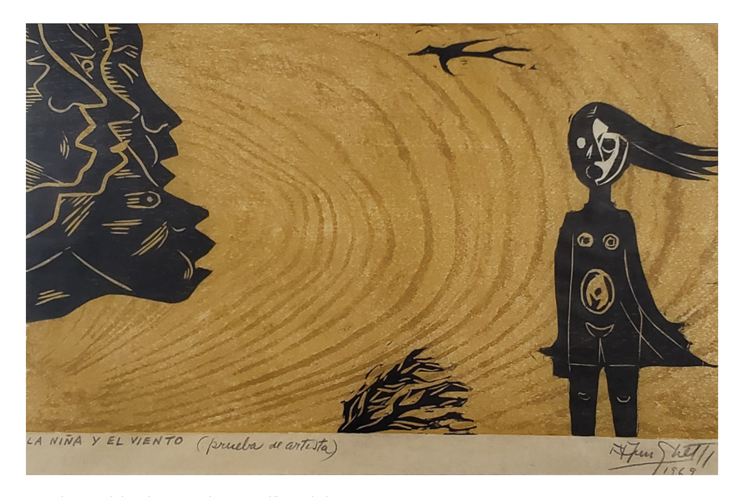
Francisco Amighetti (Costa Rica), La Niña y el viento, 1969.

The lack of basic services – particularly health care in the midst of this pandemic – will create deeper distress. In 2017, the World Bank and the World Health Organisation warned that half of the world's population did not have access to essential health services and that, each year, 100 million people are driven into poverty by the lack of income to pay for health care costs. This number is conservative, since in India alone – according to the national survey on social consumption – 55 million Indians were impoverished due to health care costs in 2011-12. That warning was not heeded.