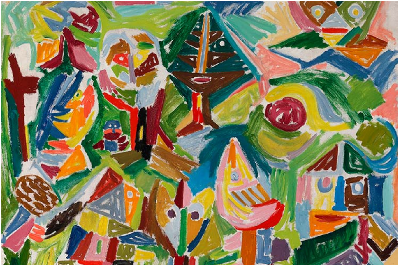
Asger Jorn (Denmark), Landscape in Finkidong , 1945.

The idea of the ‘local’ requires a sharp assessment of the hierarchies of class, ethnicity, and gender; there is no ‘local community’ or ‘local economy’ that is not torn apart by the exploitation and violence of these hierarchies. Equally, local knowledge must be seen alongside the advances of modern science, whose breakthroughs in the field of agriculture should not be discounted. What unites the platform of food sovereignty is the sharp line it creates to distinguish itself from the capitalist form of food production.