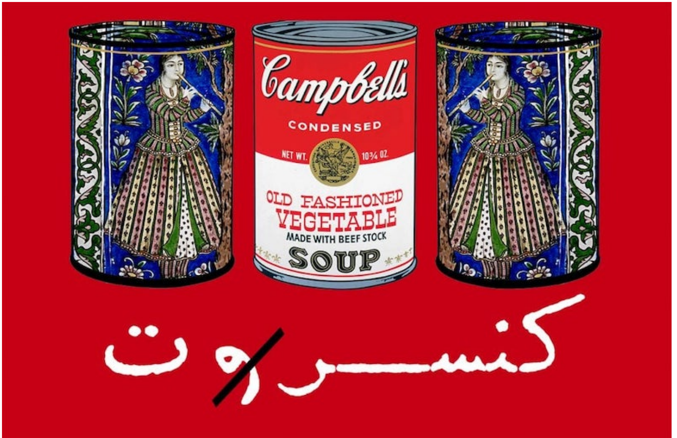
Rabee Baghshani (Iran), Concert , 2016.

International Centre for Settlement of Investment Disputes. These bodies are controlled by the Global North, and they operate almost entirely in the interest of the multinational corporations domiciled in the Global North.