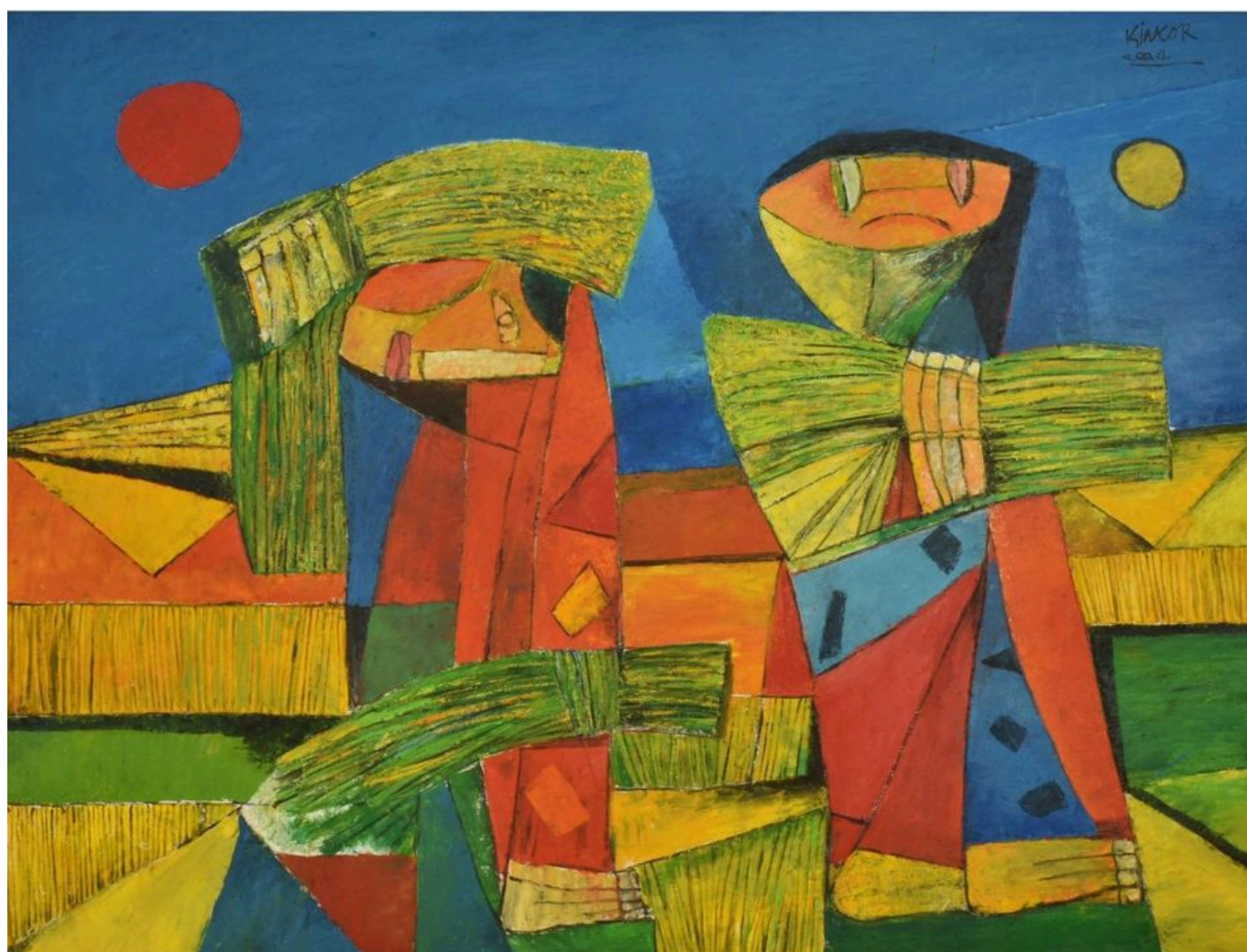
Ang Kiukok (Philippines), Harvest , 2004.