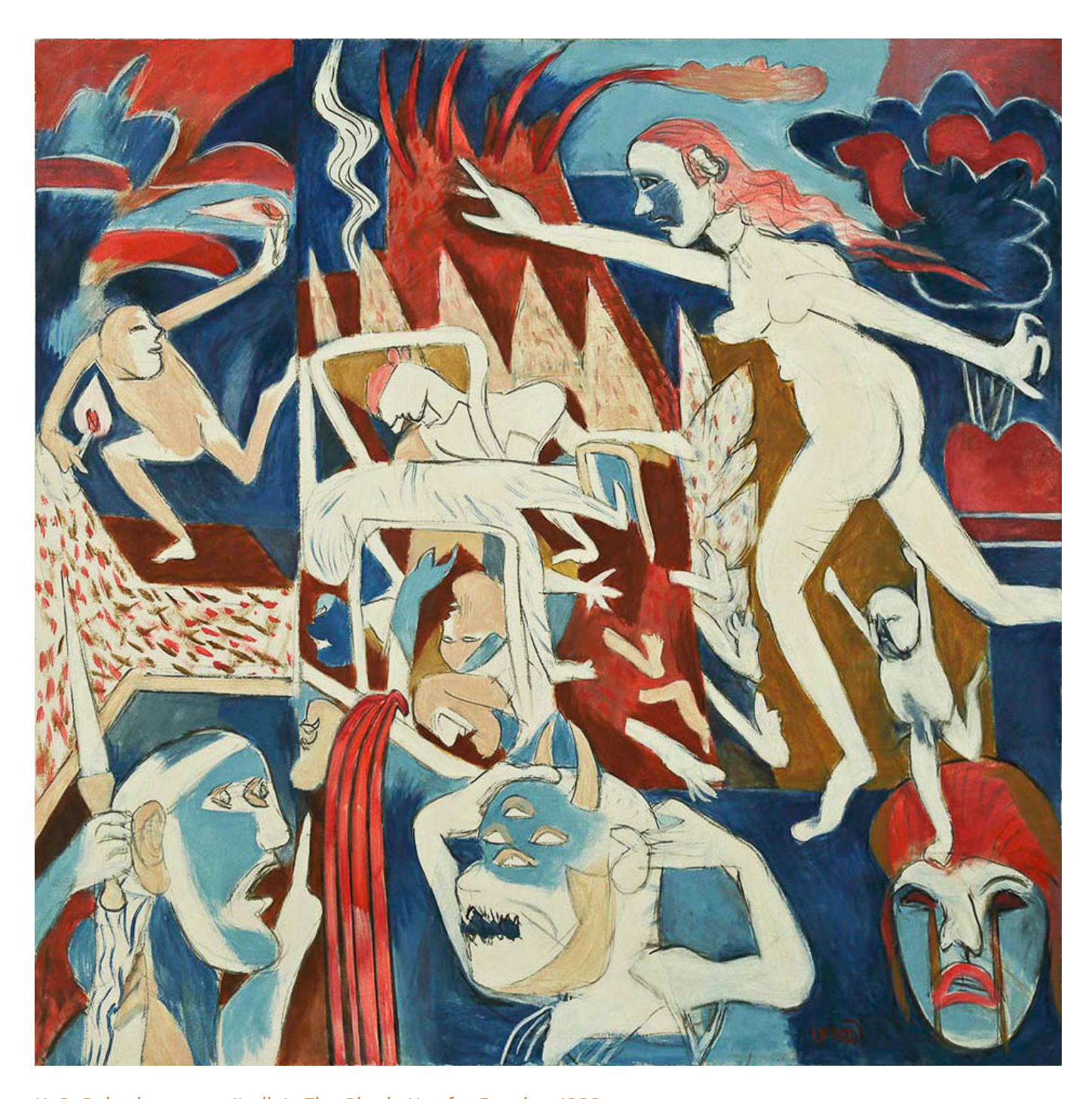
K. G. Subrahmanyan (India), The City is Not for Burning , 1993.

In 1965, as India and Pakistan slipped into another war, Sahir Ludhianvi, one of the great Urdu poets of his generation, wrote a poem called Ai Sharif Insano ('O Nobel Souls'). It begins with a summary of why war is so atrocious, for, after all, war brings fire and blood, hunger, want, and scarcity. What about a war against capitalism, suggests Sahir, rather than a war that takes the 'blood of human beings'?