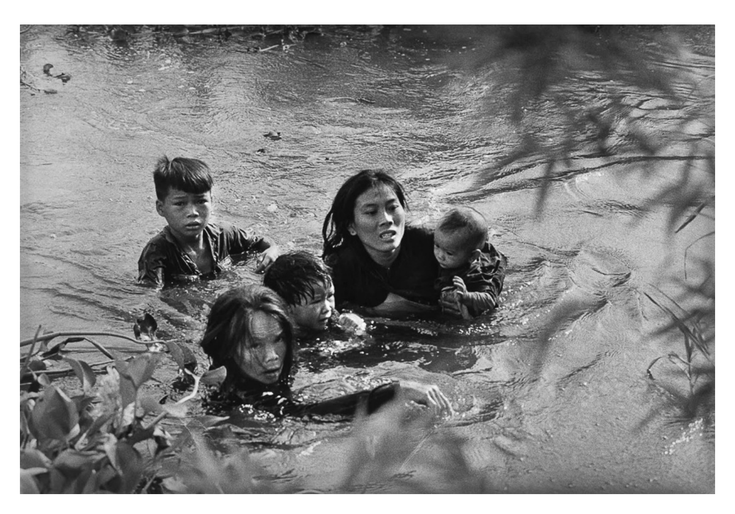
Kyōichi Sawada (Japan), A mother and her children wade across a river in Vietnam to escape US bombing, 1965.