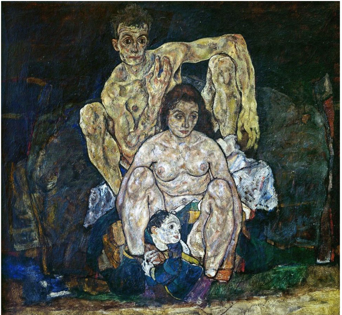
Egon Schiele (Austria), The Family , 1918.

It is welcome news that there are now vaccine candidates from a range of firms and countries, including the two m-RNA vaccines from Pfizer and Moderna, as well as Gamaleya’s Sputnik V and Sinovac’s CoronaVac. Reports from these and other vaccine candidates show positive results, which raises hope that we will soon have some kind of vaccine against COVID-19. Scientists are wary of the claims made by the private pharmaceutical companies, which have released press statements but have not made the findings of their clinical trials public. Some of these questions include whether the vaccines prevent infection, whether they prevent mortality, whether they prevent transmission, and, finally, what would be the duration of protection.