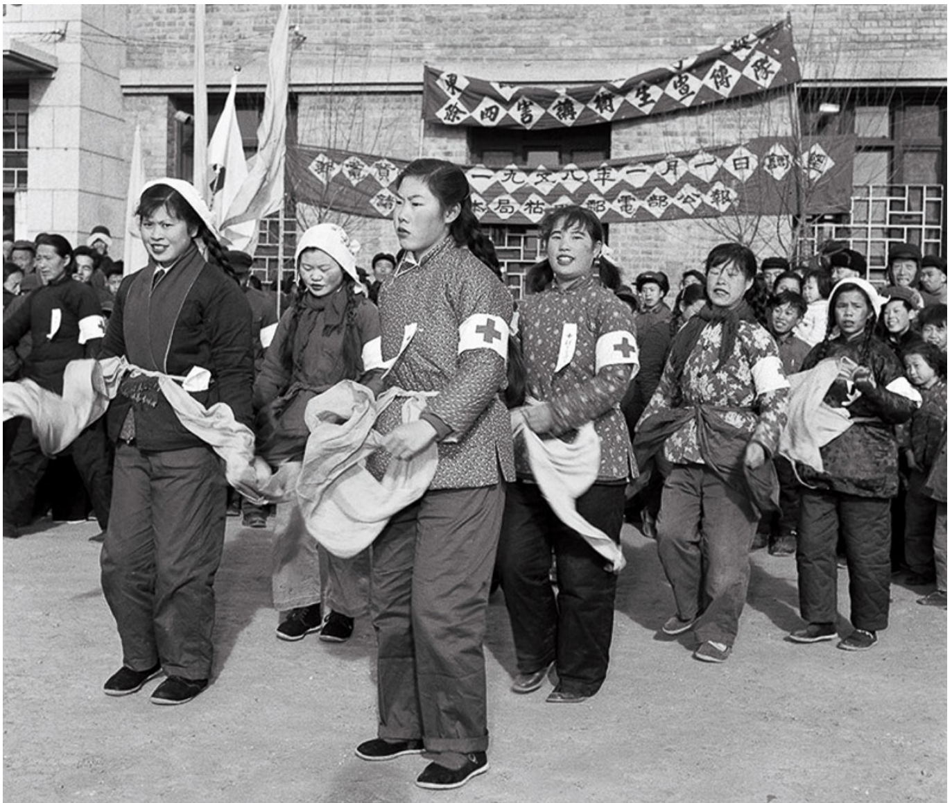
Public Health Elimination Team for the Elimination of 'Four Pests', China, 1958.