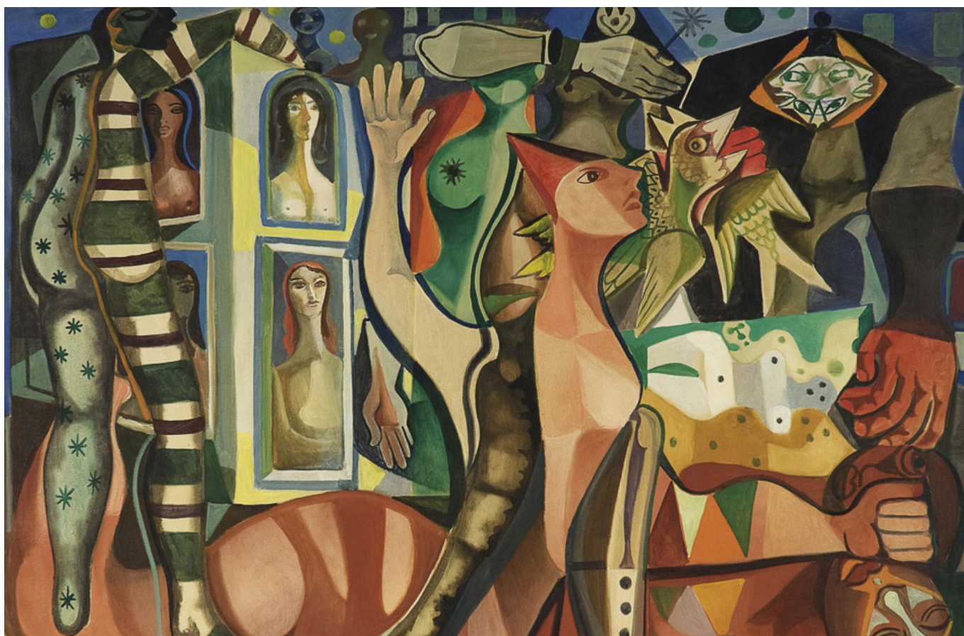
Emiliano di Cavalcanti (Brazil), Sonhos do carnaval ('Dreams of Carnival'), 1955.

In Latin America, the extreme right has used every weapon to delegitimise its adversaries, including using perfectly good laws against corruption in a malicious way to target leaders of the left. This is a strategy called ‘lawfare’, where the law is used – often without evidence – to oust democratically-elected leaders of the left or to prevent them from running for office. Lawfare was used to remove Honduran president José Manuel Zelaya in 2009, Paraguayan president Fernando Lugo in 2012, and Brazilian president Dilma Rousseff in 2016; these leaders were all victims of judicial coup d'états . Brazil’s former president Luiz Inácio Lula da Silva was denied the right to run for the presidency in 2018 by a lawsuit of no merit whatsoever amidst predictions in all polls that he would win. Argentina’s former president Cristina Fernández de Kirchner faced a series of cases beginning in 2016, all of which prevented her from running again in 2019 (she is now the vice president, a testament to her popularity in the country).