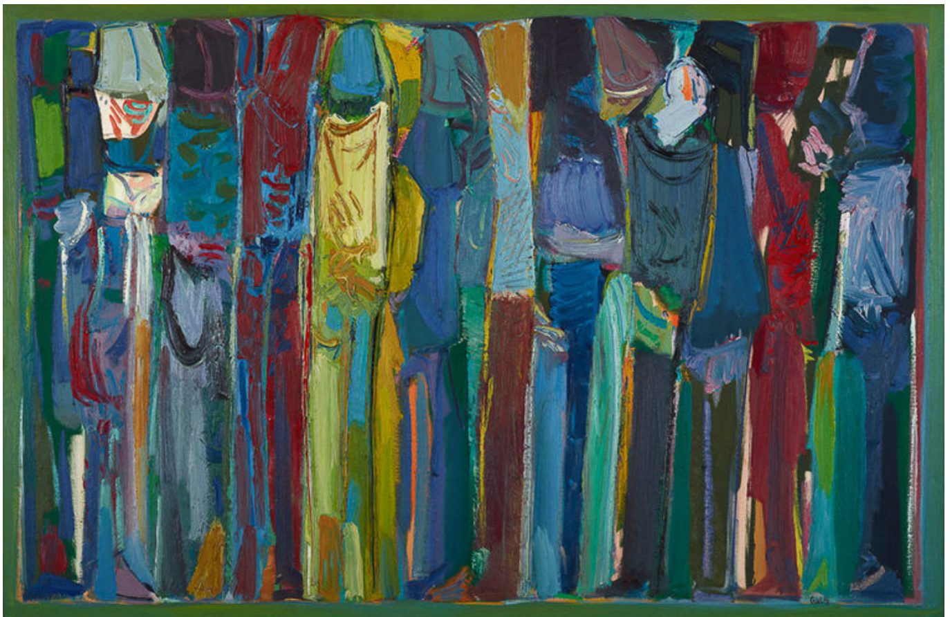
Paul Guiragossian (Lebanon), La Lutte de l'Existence ('The Struggle of Existence'), 1988

Money floods the system, eats into the loyalties of politicians, corrupts the institutions of civil society, and shapes the narratives of the media. It matters that the dominant classes in our world own the main communications outlets and that these outlets shape the way people decipher the world around us. Although the United Nations' Universal Declaration of Human Rights affirms that 'Everyone has the right to freedom of opinion and expression' (Article 19), the plain fact is that the concentration of the media in the hands of a few corporate entities circumscribes the freedom to 'impart information and ideas through any media'. For this reason, Reporters Without Borders has an ongoing Media Ownership Monitor that traces the consolidation of the media held by corporate power, which in turn drives a political agenda within existing systems of government.