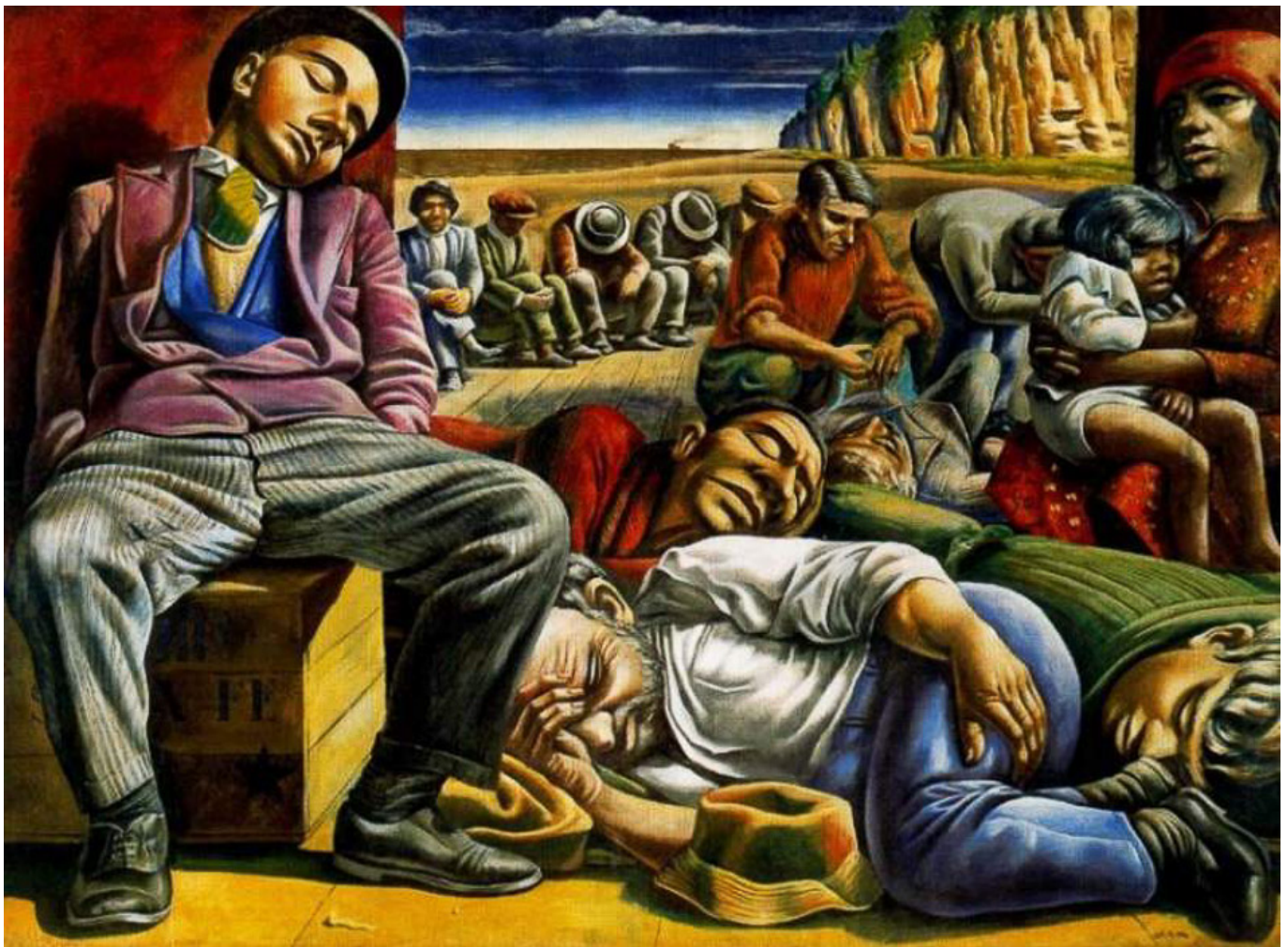
Antonio Berni (Argentina), Desocupados ('Unemployed'), 1934.

Meanwhile, in China, the socialist project has abolished absolute poverty during the pandemic. In November 2020, the authorities in Guizhou Province in southwest China announced that the last nine impoverished counties were removed from the poverty list, which means that all 832 poor counties in the country have now been lifted out of poverty. In seven years, the policies in China allowed 80 million people (roughly the entire population of Germany) to depart from poverty; in total, around 850 million Chinese people have lifted themselves out of poverty in the decades since the 1949 Revolution. There have been three metrics for this transformation: first, that every Chinese family would no longer be below the rural poverty line; second, that the communist project would end the 'two worries' of hunger and clothing; third, that the Chinese state would ensure the 'three guarantees' of education, health care, and housing. All of this occurred during the pandemic.