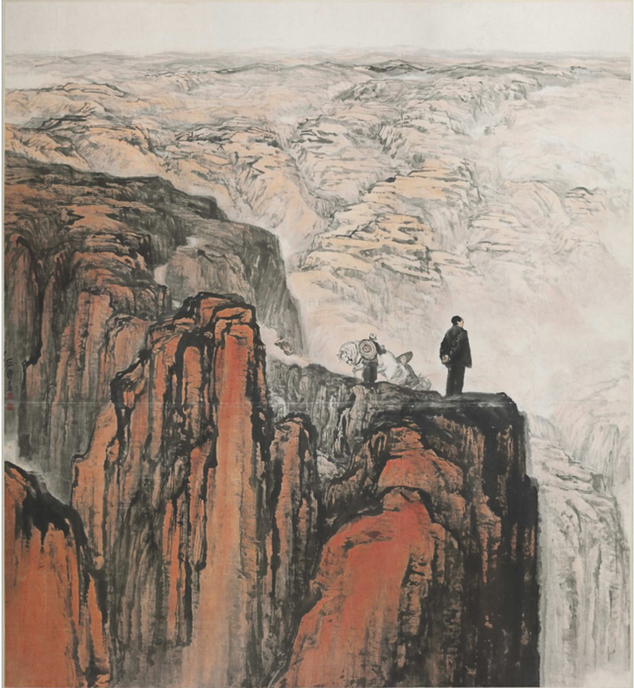
Shi Lu (People's Republic of China), Fighting in Northern Shaanxi , 1959.

of the majority of the people before the profits of the minority.