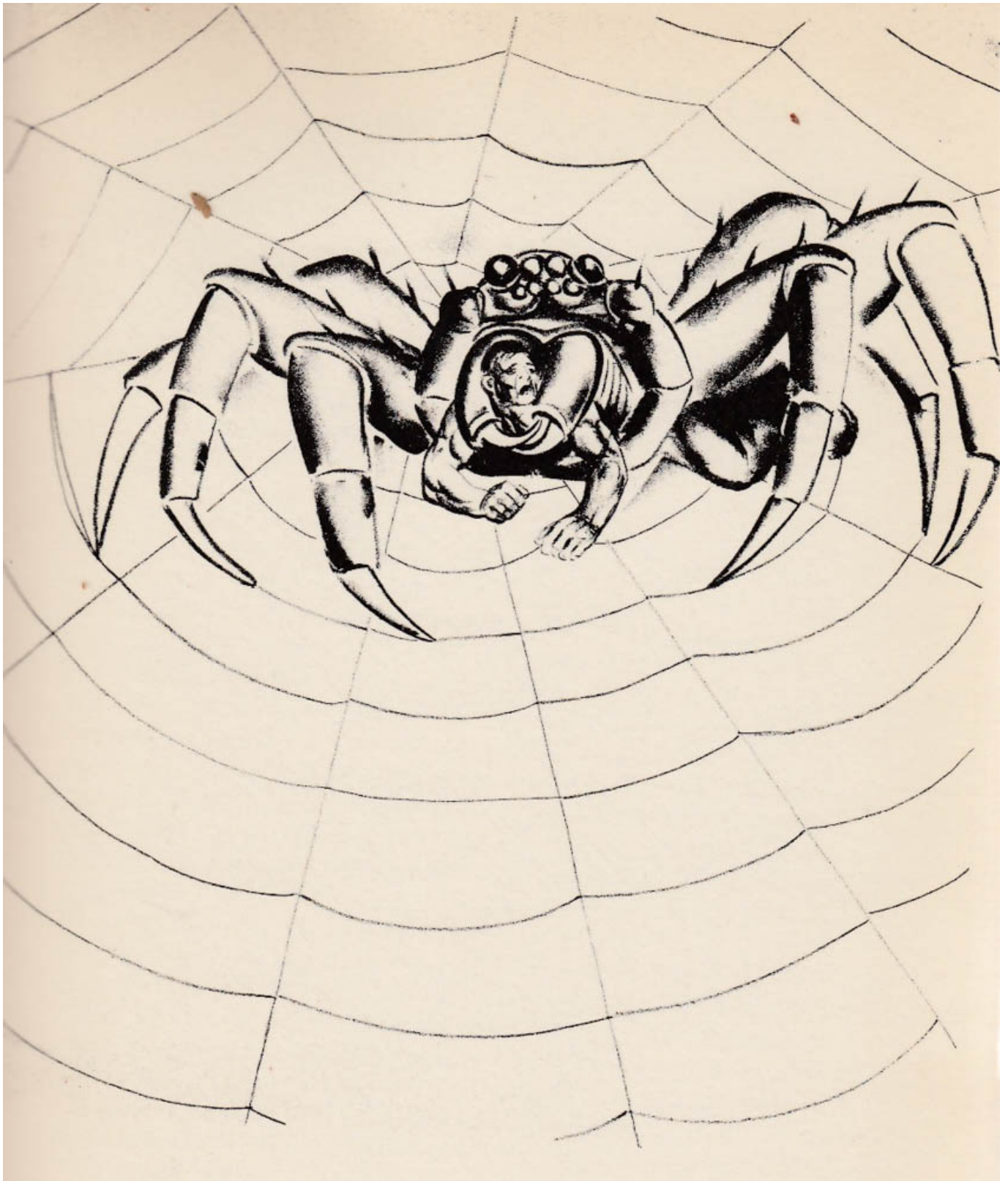
Hugo Gellert (USA), Comrade Gulliver, 1935.