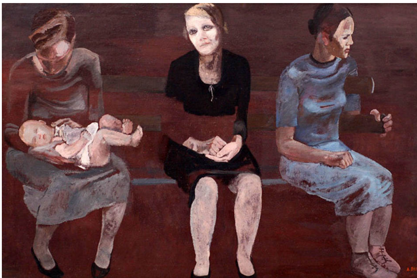
Aleksandr Deyneka (USSR), Unemployed in Berlin , 1932.

‘And with the pandemic’, write the World Bank analysts, ‘the newly poor are more likely to live in congested urban settings and to work in the sectors most affected by lockdowns and mobility restrictions; many are engaged in informal services and not reached by existing social safety nets’. These are the billions who will slide deeper into debt and despair, with education and healthcare slipping away from them as hunger rates rise.