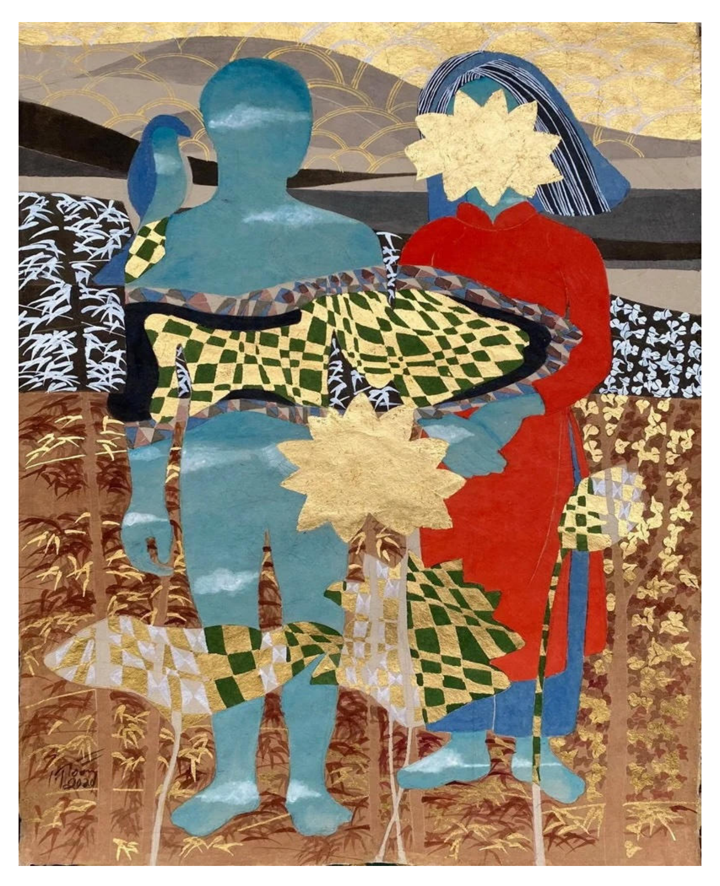
Dinh Thi Tham Poong (Vietnam), Side by Side, 2020.