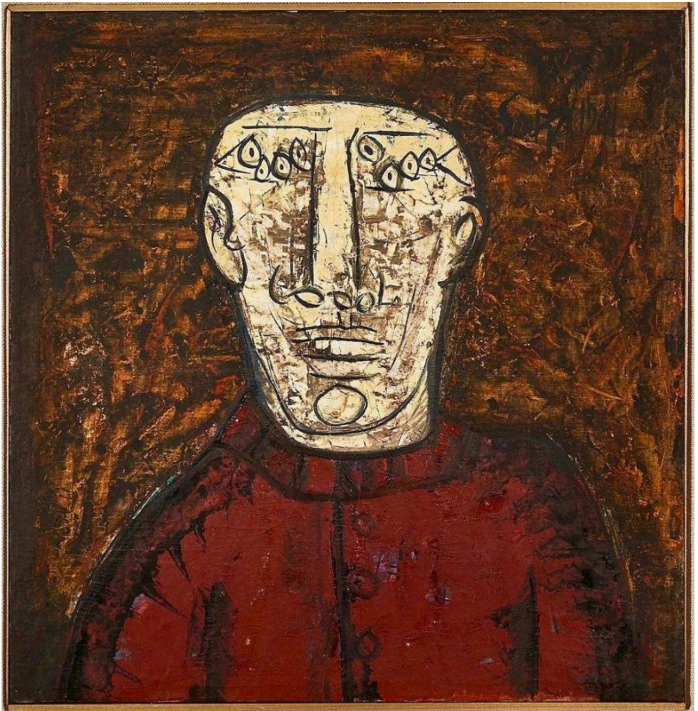
Francis Newton Souza (India), The Foreman , 1961.

People's movements across the world emerge out of the grievances and hopes of workers and peasants, of people who are exploited to accumulate capital for the propertied few and oppressed by social hierarchies. If enough people refuse to submit to the obstinate facts of hunger or illiteracy, their actions could turn into a rebellion, or even into a revolution. This refusal to submit requires confidence and clarity.