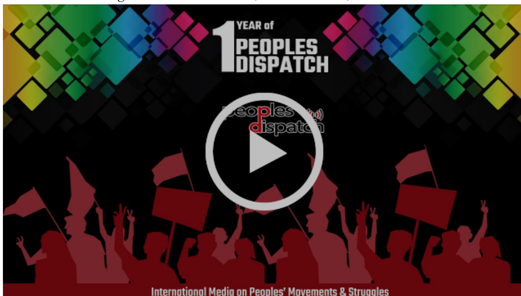
People's Dispatch Turns One.