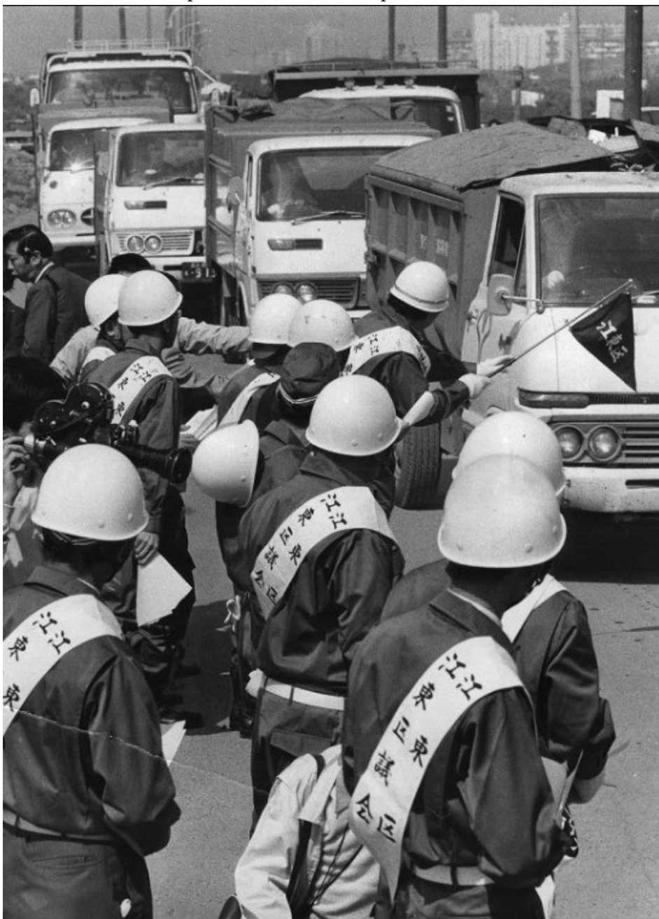
Members of the Kōtō ward assembly checking garbage trucks entering their neighbourhood, 22 May 1973.

Waste poses a serious problem. A World Bank report estimates that humans produce 2.01 billion metric tonnes of trash per year. By 2050, that figure will rise by 70% to 3.4 billion metric tonnes. Of this trash, only 13.5% is recycled, while only 5.5% is composted. Thus, 81% of this trash is discarded in landfills or incinerated. If we continue at our current pace, we will need new planets as landfills.