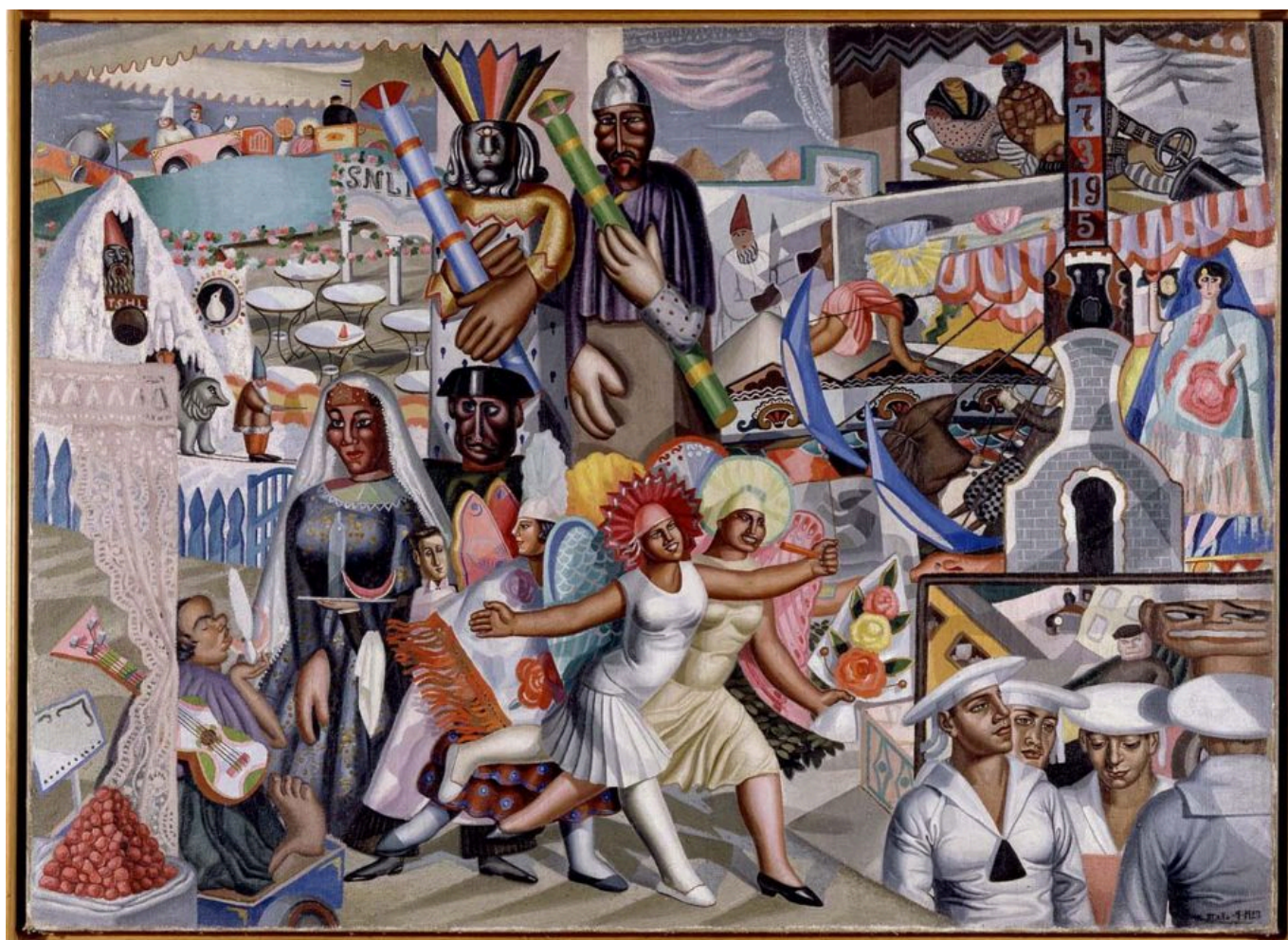
Maruja Mallo (Spain), La Verbena ('The Fair'), 1927.