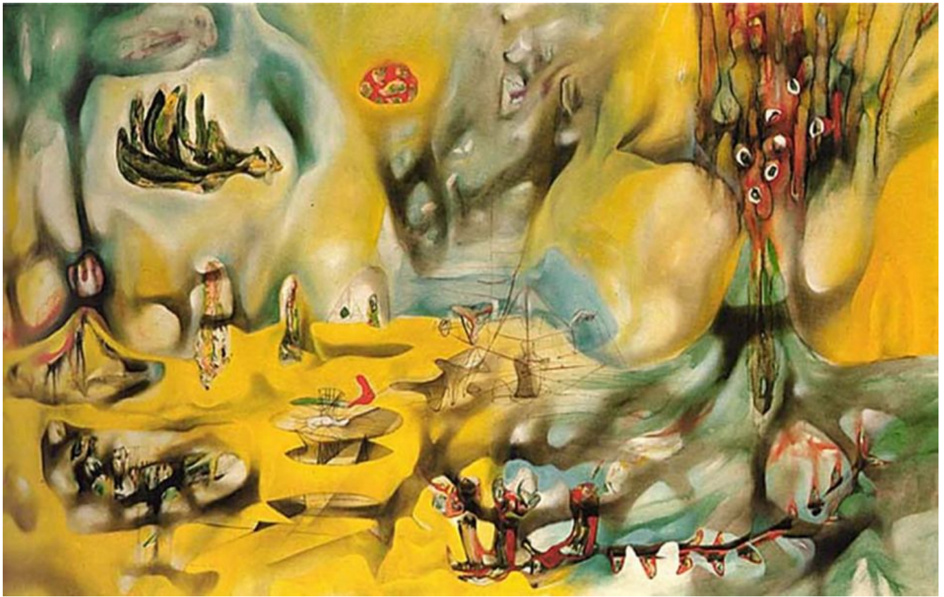
Roberto Matta (Chile), Invasion of the Night , 1942.

The World Bank has sounded the alarm, but the forces of ‘centrism’ – beholden to the billionaire class and the politics of austerity – simply refuse to pivot away from the neoliberal catastrophe. If a leader of the centre-left or left tries to wrench their country out of persistent social inequality and polarised wealth distribution, they face the wrath of not merely the ‘centrists’, but the wealthy bondholders in the North, the International Monetary Fund, and the Western states. When Pedro Castillo won the presidency in Peru in July 2021, he was not permitted to pursue even a Scandinavian form of social democracy; the coup machinations against him began before he was inaugurated. The civilised politics that would end hunger and illiteracy are simply not permitted by the billionaire class, who spend vast amounts of money on think tanks and media to undermine any project of decency and fund the dangerous forces of the far right, who shift the blame for social chaos away from the tax-free ultra-rich and the capitalist system and onto the poor and marginalised.