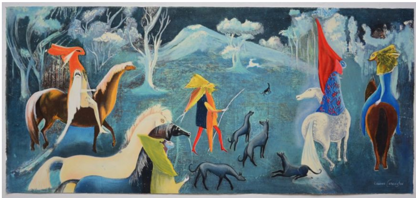
Leonora Carrington (Mexico), Figuras fantásticas a caballo ('Fantastical Figures on Horseback'), 2011.

After the Soviet Union collapsed in 1991 and the Third World Project withered as a result of the debt crisis, the US-driven agenda of neoliberal globalisation prevailed. This programme was characterised by the state's withdrawal from the regulation of capital and by the erosion of social welfare policies. The neoliberal framework had two major consequences: first, a rapid increase in social inequality, with the growth of billionaires at one pole and the growth of poverty at the other, along with an exacerbation of inequality along North-South lines; and second, the consolidation of a 'centrist' political force that pretended that history, and therefore politics, had ended, leaving only administration (which in Brazil is well-named as centrão , or the 'centre') remaining. Most countries around the world fell victim to both the neoliberal austerity agenda and this 'end of politics' ideology, which became increasingly anti-democratic, making the case for technocrats to be in charge. However, these austerity policies, cutting close to the bone of humanity, created their own new politics on the streets, a trend that was foreshadowed by the IMF riots and bread riots of the 1980s and later coalesced into the 'anti-globalisation' protests. The US-driven globalisation agenda produced new contradictions that belied the argument that politics had ended.