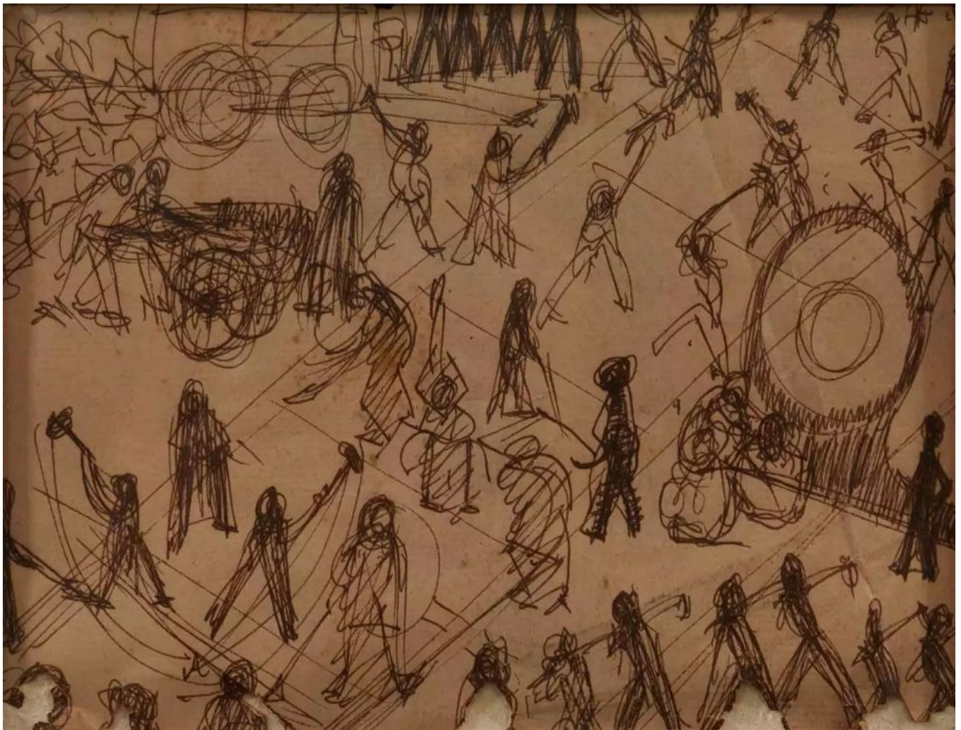
Kartick Chandra Pyne (India), Workers , 1965.

The slogans and signs that pervaded Brasília on 8 January were less about Bolsonaro and more about the rioters’ hatred for Lula and the potential of his pro-people government. This sentiment is shared by big business sectors – mainly agribusiness – which are furious about the reforms proposed by Lula. The attack was partly the result of the built-up frustration felt by people who have been led , by intentional misinformation campaigns and the use of the judicial system to unseat the Lula’s party, the Workers’ Party (PT), through ‘lawfare’, to believe that Lula is a criminal – even though the courts have ruled this to be false. It was also a warning from Brazil’s elites. The unruly nature of the attack on Brasília resembles the 6 January 2021 attack on the US Capitol by supporters of former US President Donald Trump. In both cases, far-right illusions, whether about the dangers of the ‘socialism’ of US President Joe Biden or the ‘communism’ of Lula, symbolise the hostile opposition of the elites to even the mildest rollback of neoliberal austerity.