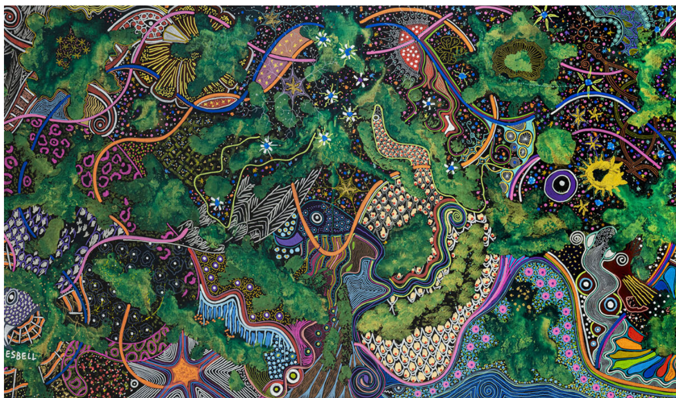
Jaider Esbell (Brazil), The Intergalactic Entities Talk to Decide the Universal Future of Humanity , 2021.