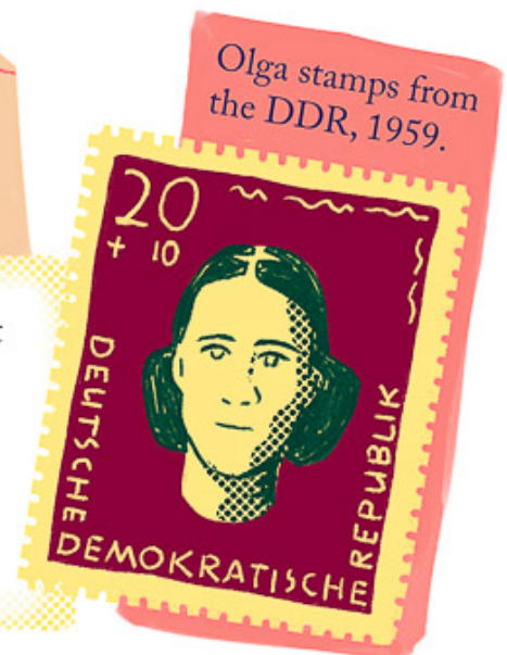
Olga stamps from the DDR, 1959.

Olga Benário Prestes was a German communist militant of Jewish origin who arrived in Brazil in 1934. Together with Luiz Carlos Prestes, she participated in the insurrection of 1935, which sought to take down the Vargas dictatorship and has since been used to bolster deep anticommunism within the Armed Forces.