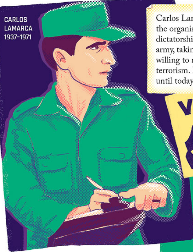
CARLOS LAMARCA 1937-1971

Carlos Lamarca became a major icon within the organised resistance to the military dictatorship of 1964. He deserted from the army, taking with him weapons and supporters willing to militarily resist the regime's terrorism. For this reason, he is remembered until today by the military as a so-called traitor.