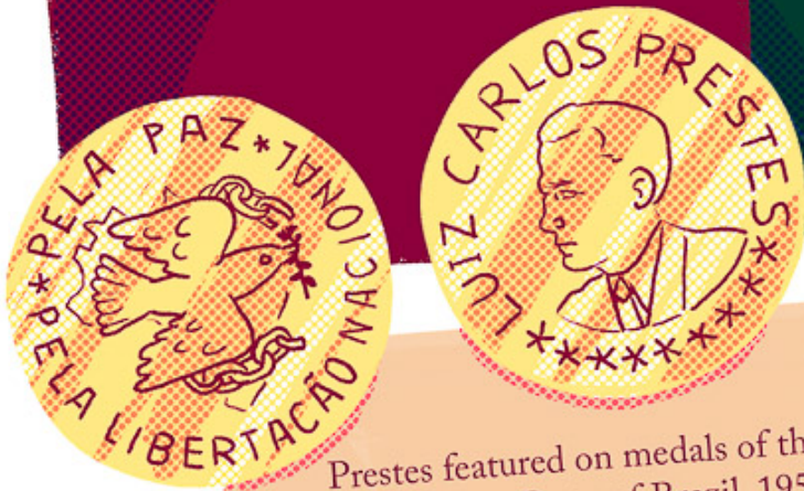
Prestes featured on medals of the Communist Party of Brazil, 1954.

Olga Benário Prestes was a German communist militant of Jewish origin who arrived in Brazil in 1934. Together with Luiz Carlos Prestes, she participated in the insurrection of 1935, which sought to take down the Vargas dictatorship and has since been used to bolster deep anticommunism within the Armed Forces.