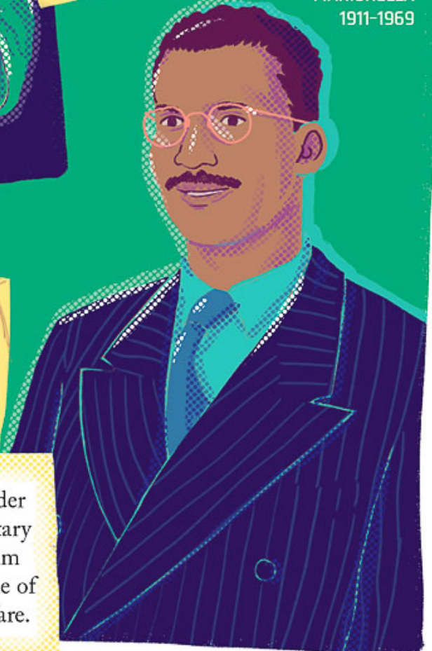
CARLOS MARIGHELLA 1911-1969

Logo of the Popular Revolutionary Vanguard.