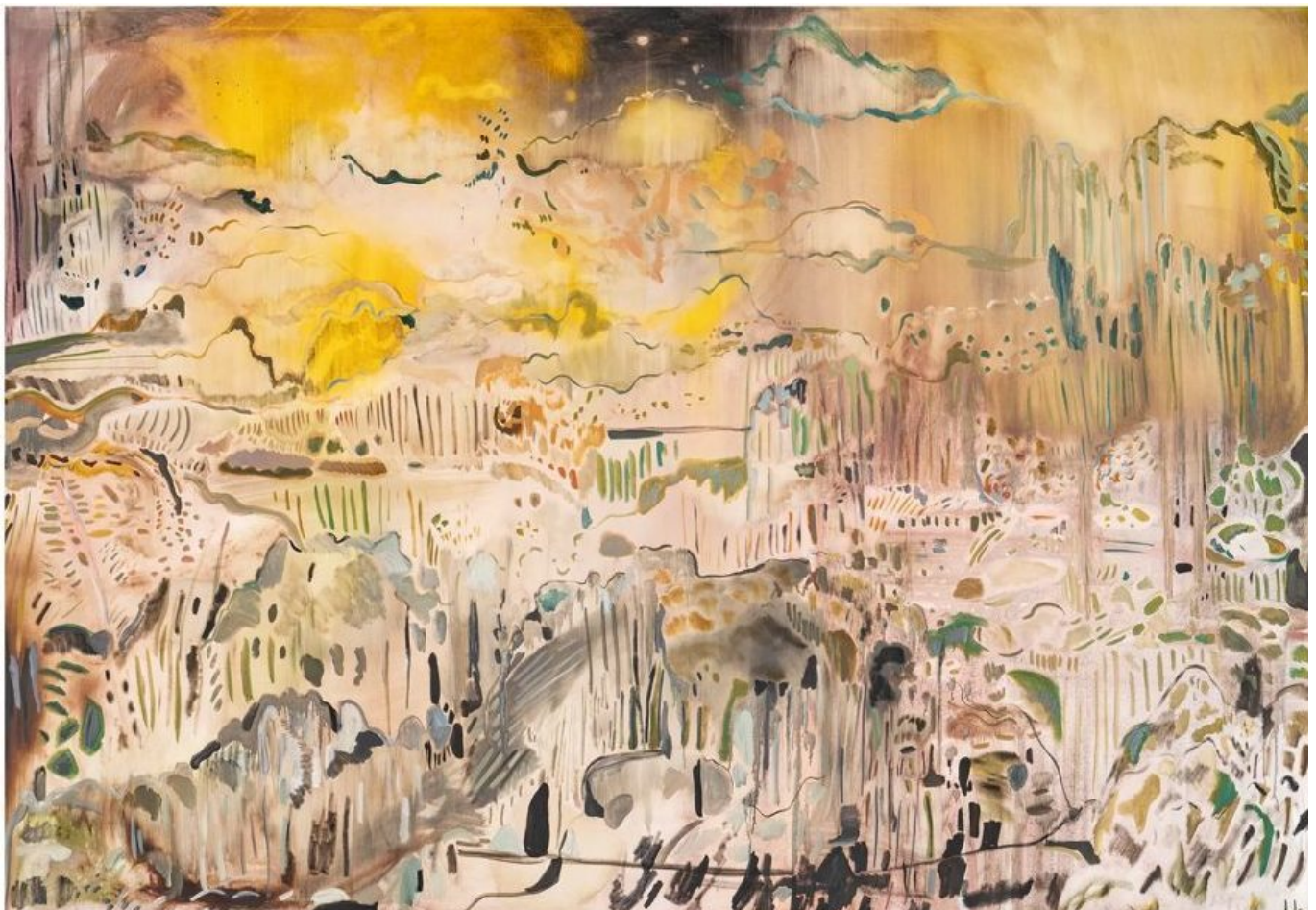
Alia Ahmad (Saudi Arabia), Hameel - Morning Rain , 2022.

The West, perhaps because of its rapid relative economic decline, is struggling to maintain its hegemony by driving a New Cold War against emergent states such as China. Perhaps the single best evidence of the racial, political, military, and economic plans of the Western powers can be summed up by a recent declaration of the North Atlantic Treaty Organisation (NATO) and the European Union (EU): ‘NATO and the EU play complementary, coherent and mutually reinforcing roles in supporting international peace and security. We will further mobilise the combined set of instruments at our disposal, be they political, economic, or military, to pursue our common objectives to the benefit of our one billion citizens’.