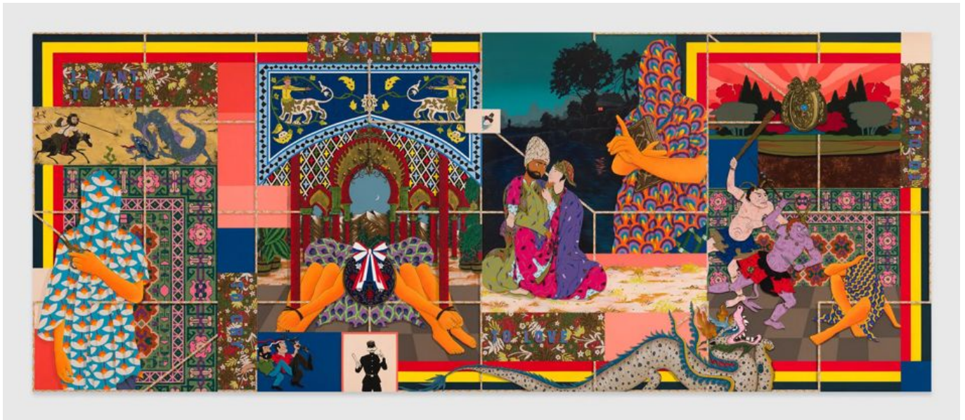
Amir H. Fallah (Iran), I Want To Live, To Cry, To Survive, To Love, To Die , 2023.

In their communiqué, the BRICS nations write about the importance of ‘comprehensive reform of the UN, including its Security Council’. Currently, the UN Security Council has fifteen members, five of which are permanent (China, France, Russia, the UK, and the US). There are no permanent members from Africa, Latin America, or the most populous country in the world, India. To repair these inequities, BRICS offers its support to ‘the legitimate aspirations of emerging and developing countries from Africa, Asia, and Latin America, including Brazil, India, and South Africa to play a greater role in international affairs’. The West’s refusal to allow these countries a permanent seat at the UN Security Council has only strengthened their commitment to the BRICS process and to enhance their role in the G20.