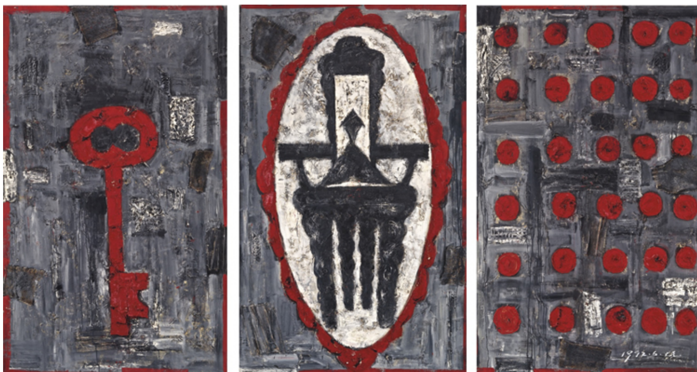
Mao Xuhui (China), '92 Paternalism , 1992.