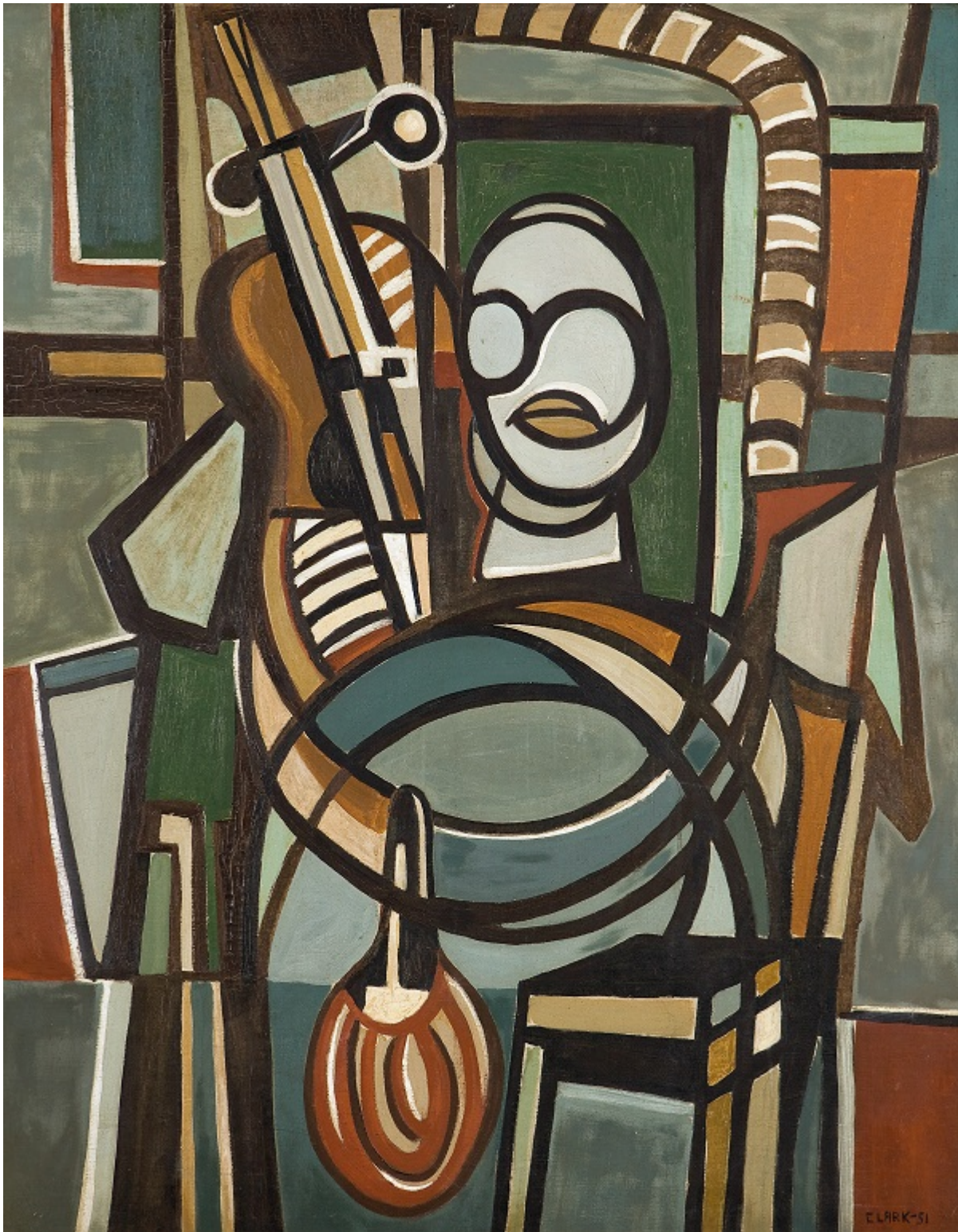
Lygia Clark (Brazil), O Violoncelista ('The Violoncellist'), 1951.