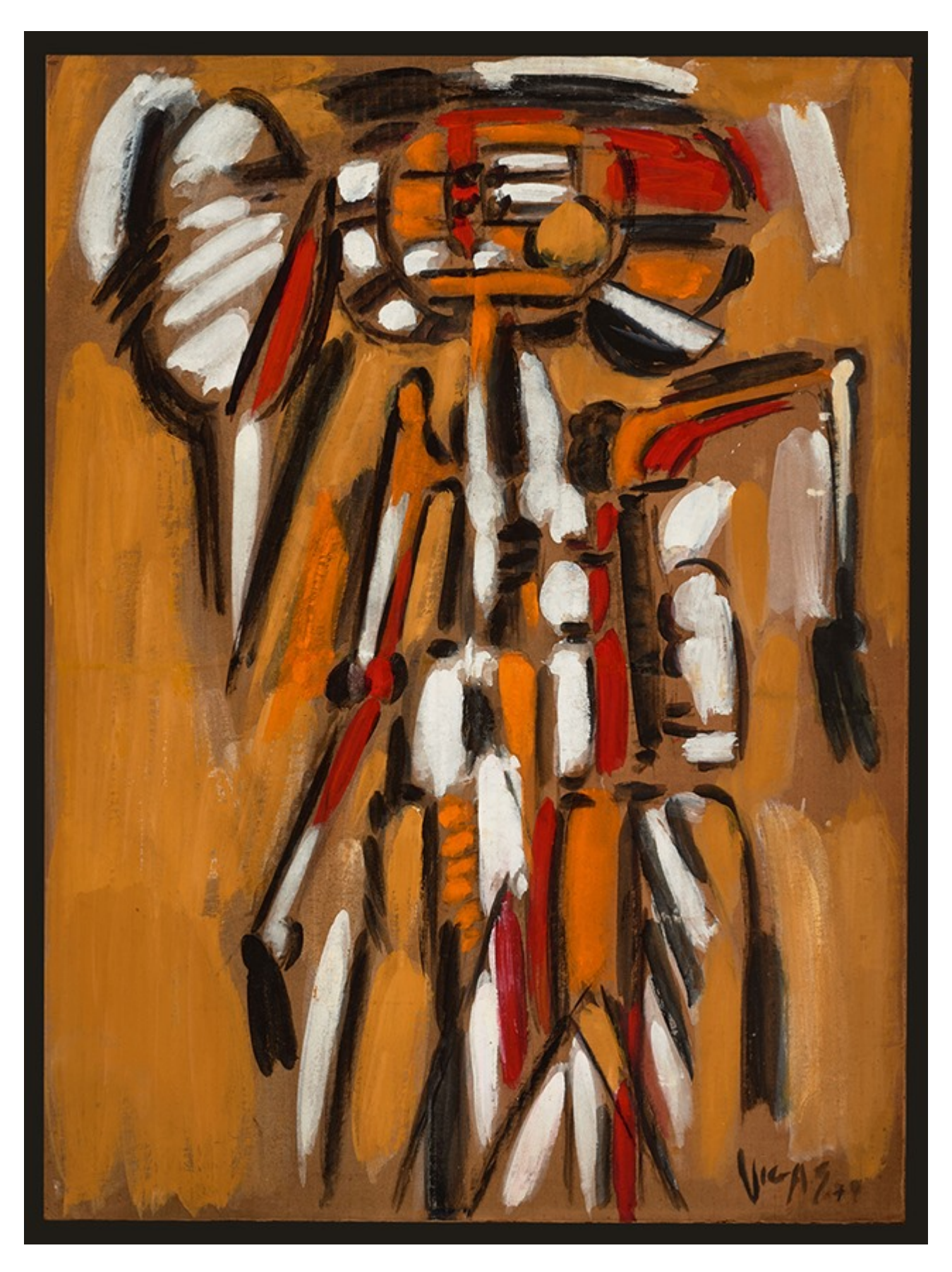
Oswaldo Vigas (Venezuela), Duende Rojo ('Red Elf'), 1979.