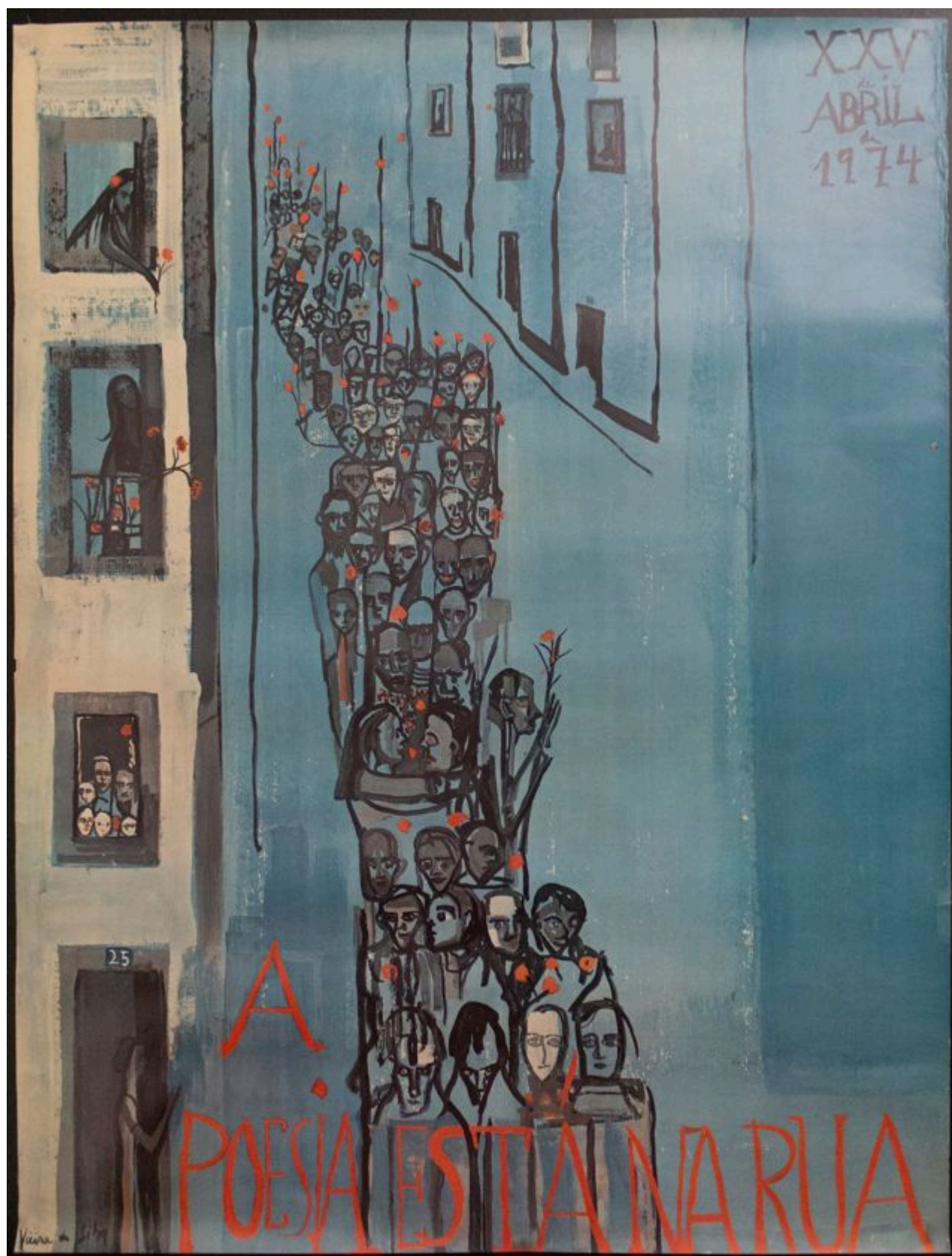
Maria Helena Vieira da Silva (Portugal), A Poesia Está Na Rua I [Poetry Is out on the Street I], 1974.