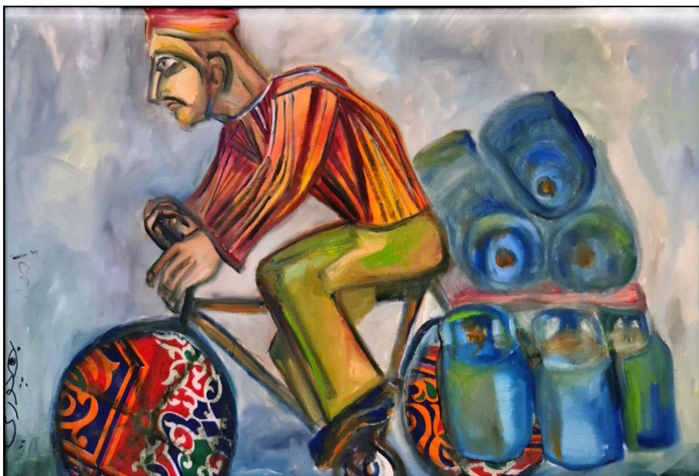
George Bahgoury (Egypt), Untitled , 2015.