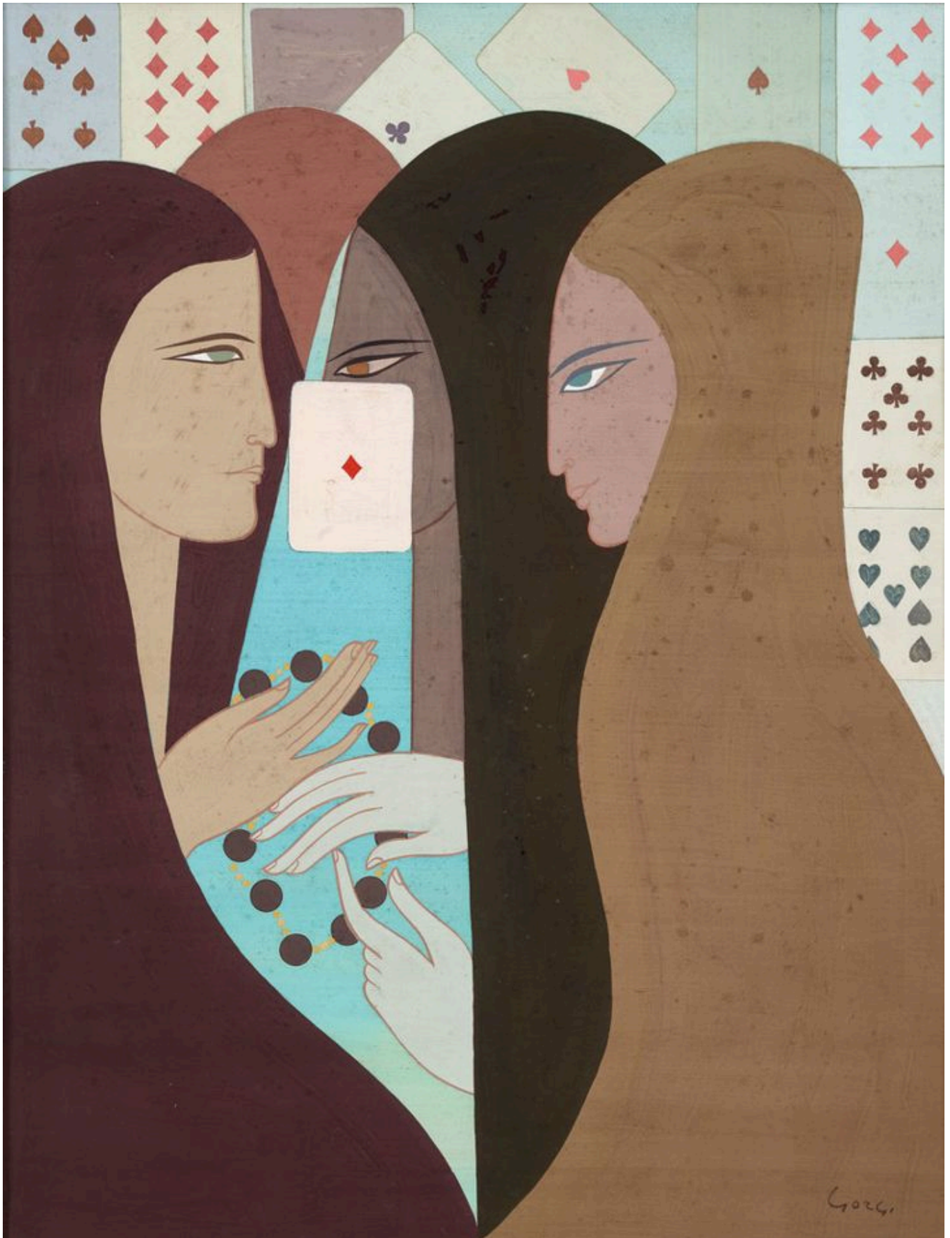
Abdelaziz Gorgi (Tunisia), Les Joueuses de Cartes ('Card Players'), 1973.