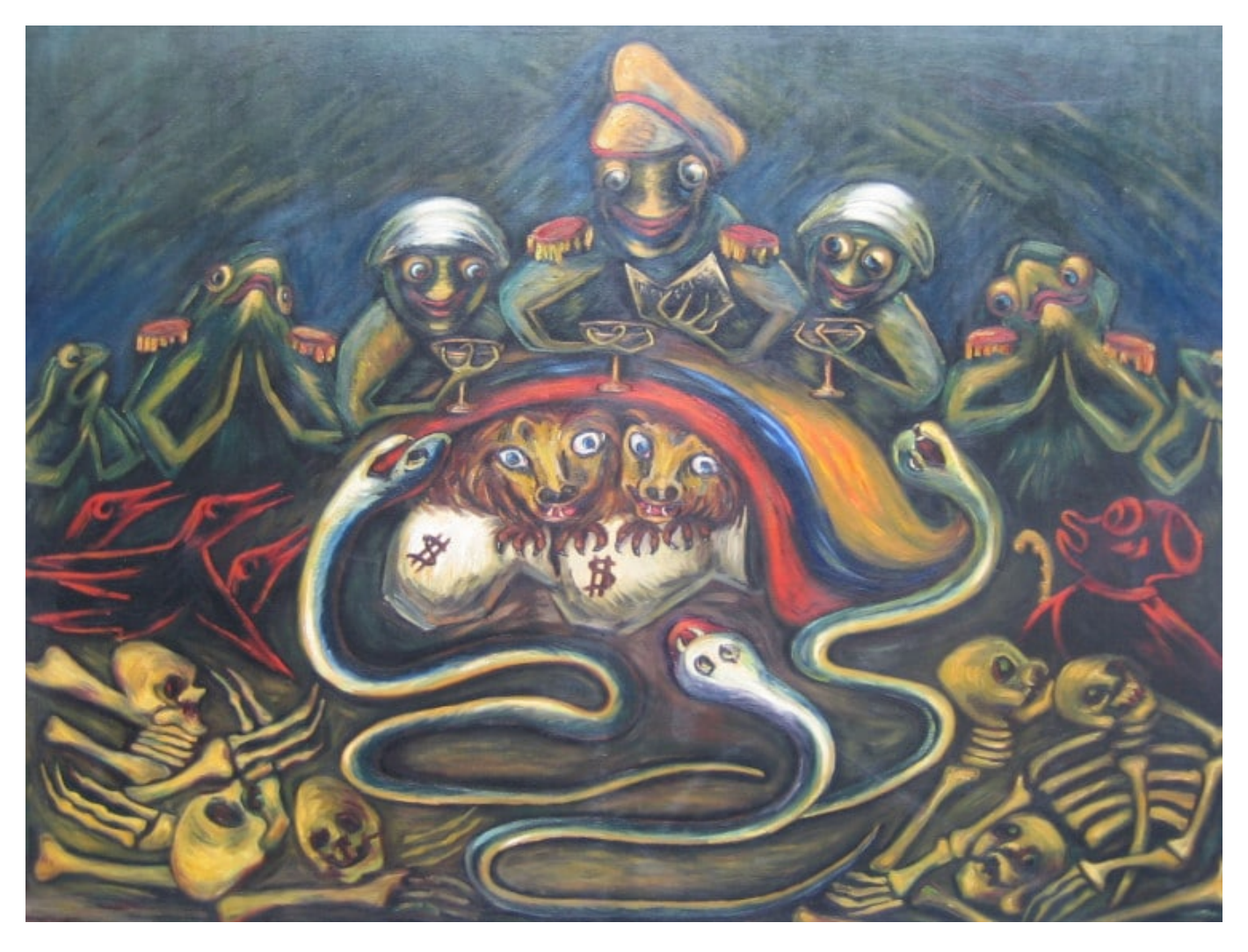
Débora Arango (Colombia), Rojas Pinilla, 1957.

In the United States, for instance, almost two million people – disproportionately Black and Latino – are caught in the prison industrial complex , with 400,000 of them imprisoned or on probation for nonviolent drug offences (mostly as petty dealers in a vastly profitable drug empire). The collapse of employment opportunities for young people in working-class areas and the allure of wages from the drug economy continue to attract low-level employees of the global drug commodity chain, despite the dangers of this profession. The War on Drugs has made a negligible impact on this pipeline, which is why many countries have now begun to decriminalise drug possession and drug use (particularly cannabis).