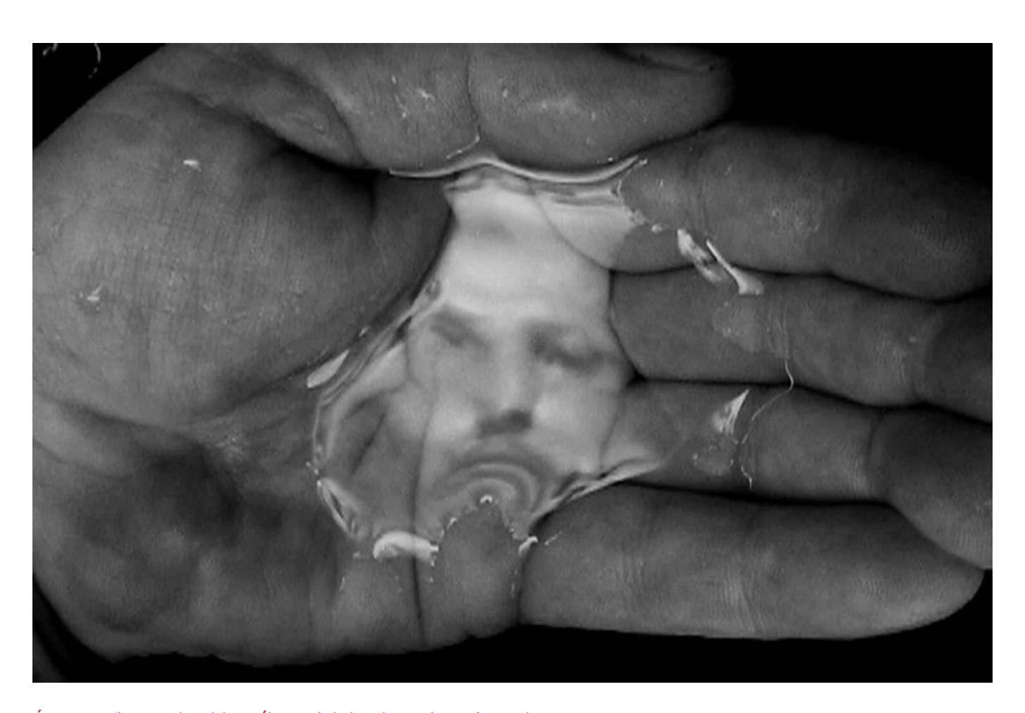
Óscar Muñoz (Colombia), Linea del destino ('Line of Destiny'), 2006.