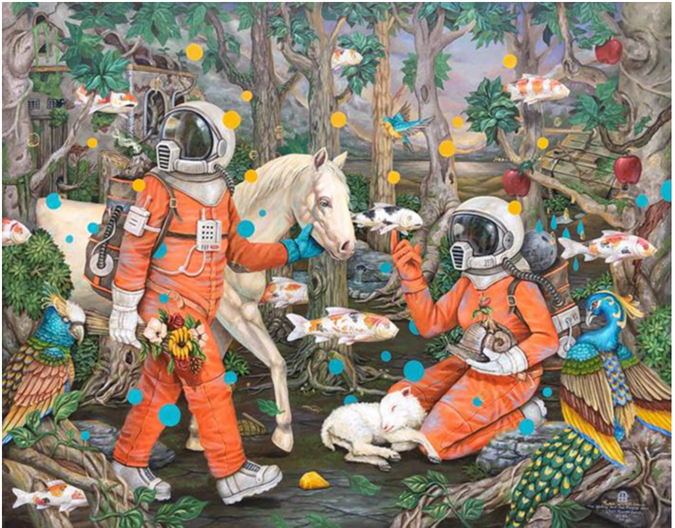
Iwan Suastika (Indonesia), The Beauty and the Fragile Ones (Planet Earth) , 2020.

In the days before the COP26 meeting, UN High Commissioner for Human Rights Michelle Bachelet said , ‘It is time to put empty speeches, broken promises, and unfulfilled pledges behind us. We need laws to be passed, programmes to be implemented, and investments to be swiftly and properly funded, without further delay’. However, there has been a delay since the 1992 UN Conference on Environment and Development in Rio de Janeiro. Picking up on the UN Conference on the Human Environment held in Stockholm (1972), the countries of the world pledged to do two things: reverse the degradation of the environment and recognise the ‘common but differentiated responsibilities’ of developed and developing countries. It was clear that developed countries – mainly the West, the old colonial powers – had used up far more than their share of the ‘carbon budget’, while developing countries had not contributed nearly as much to the climate catastrophe and struggled to fulfil their basic obligations to their populations.