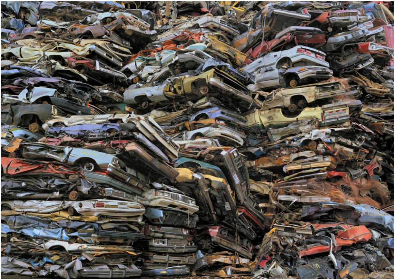
Chris Jordan (USA), Crushed Cars #2 Tacoma , 2004.