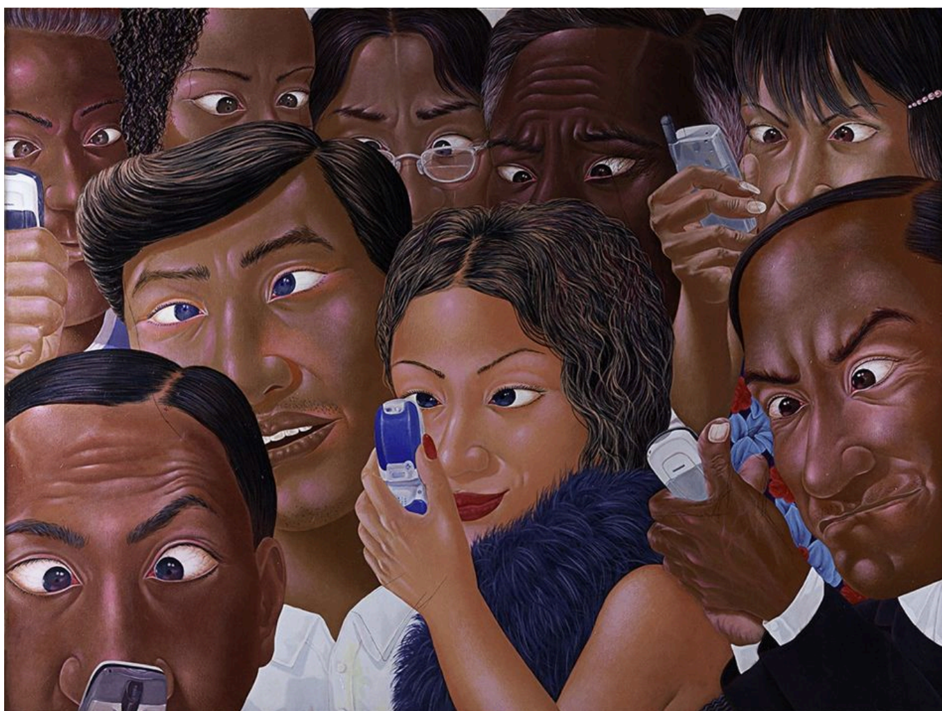
I. Nyoman Masriadi (Indonesia), Juling ('Cross-Eyed'), 2005.

adaptation, and investment, not through the empty conversation of the COP. Indonesia’s deputy minister for environment and forestry management, Nani Hendriati, explained how the country would promote ecotourism in the mangrove forests through a ‘ blue carbon ’ approach to ensure that tourism does not tear up the mangroves, seeking to halt the longstanding and rampant deforestation in the country (for example, 40% of Indonesia’s vast mangrove system was destroyed between 1980 and 2005 alone). New initiatives in the country, for instance, promote crab farming in the mangroves rather than allowing their destruction. In this spirit, Indonesia’s President Joko Widodo took world leaders to plant mangrove seeds in the Taman Hutan Raya Ngurah Rai Forest Park during the G20 meeting in Bali, Indonesia, which took place after COP27.