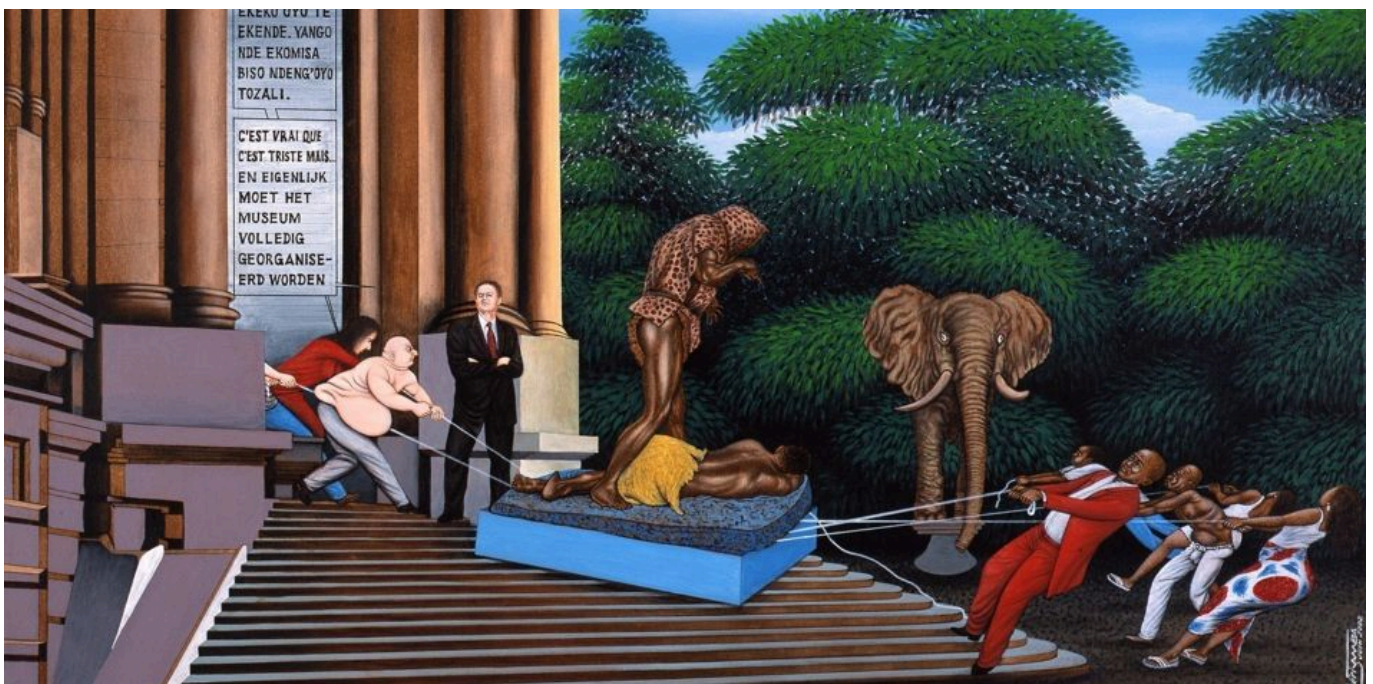
Chéri Samba (Democratic Republic of the Congo), Reorganisation , 2002.