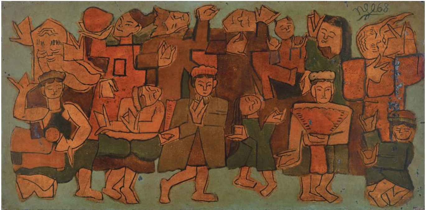
Nguyễn tư Nghiêm (Vietnam), The Dance , 1968.

In November 2021, Tricontinental: Institute for Social Research worked alongside twenty-six research institutes to develop A Plan to Save the Planet . The plan has many sections, each of which emerged out of deep study and analysis. One of the key sections is on health, with thirteen clear policy proposals: