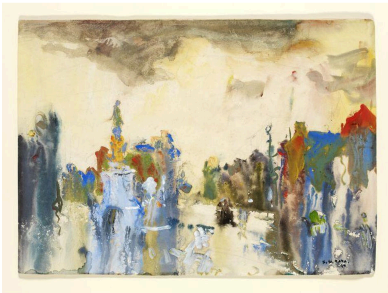
S. H. Raza (India), Monsoon in Bombay , 1947-49.

On 5 May, the WHO released its findings on the excess deaths caused by the COVID-19 pandemic. Over the 24-month period of 2020 and 2021, the WHO estimated the pandemic's death toll to be 14.9 million. A third of these deaths (4.7 million) are said to have been in India; this is ten times the official figure released by the Government of Prime Minister Narendra Modi, which has disputed the WHO's figures. One would have thought that these staggering numbers - nearly 15 million dead globally in the two-year period - would be sufficient to strengthen the will to rebuild depleted public health systems. Not so.