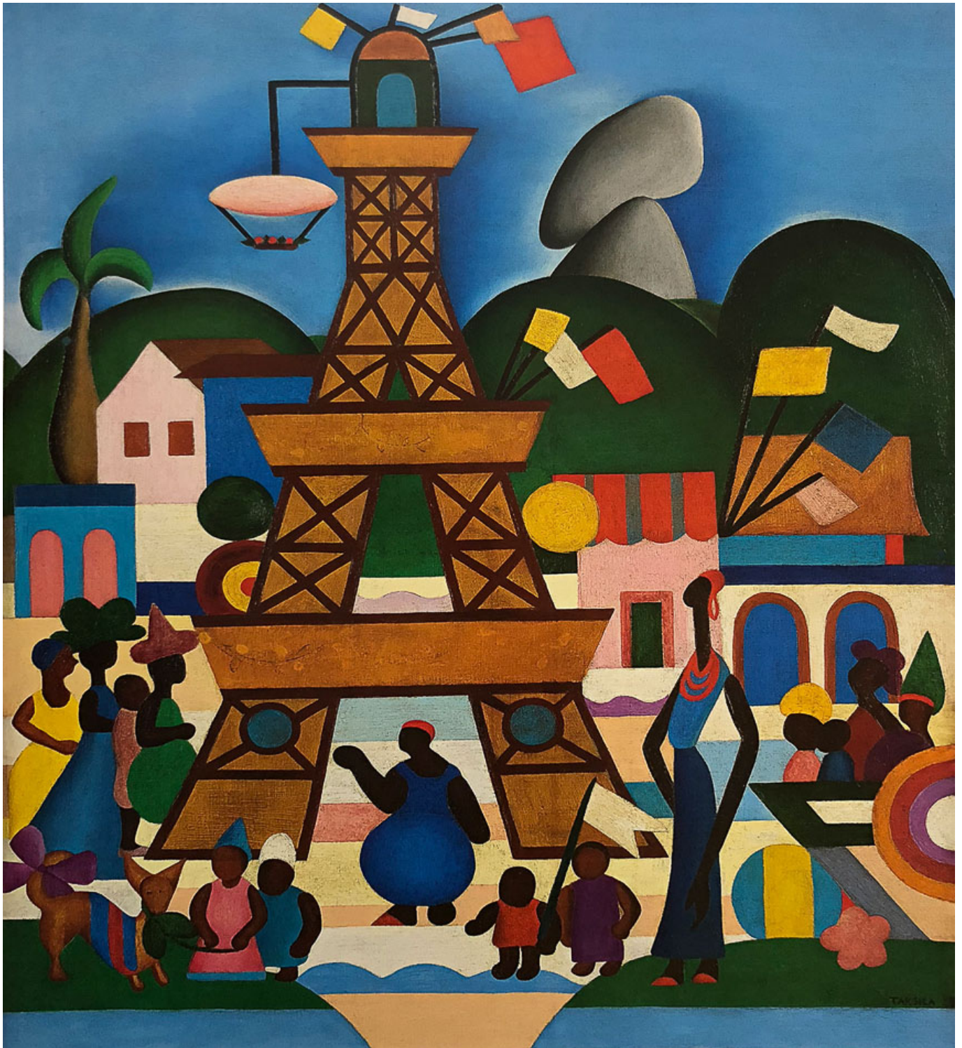
Tarsila do Amaral (Brazil), Carnival in Madureira , 1924.

Countries such as the United States and India – and to a lesser extent Brazil – were hit hard because their public health infrastructure had been weakened and their private health systems were simply not capable of managing a crisis of this proportion. During the recent spread of the Omicron variant in the United States,