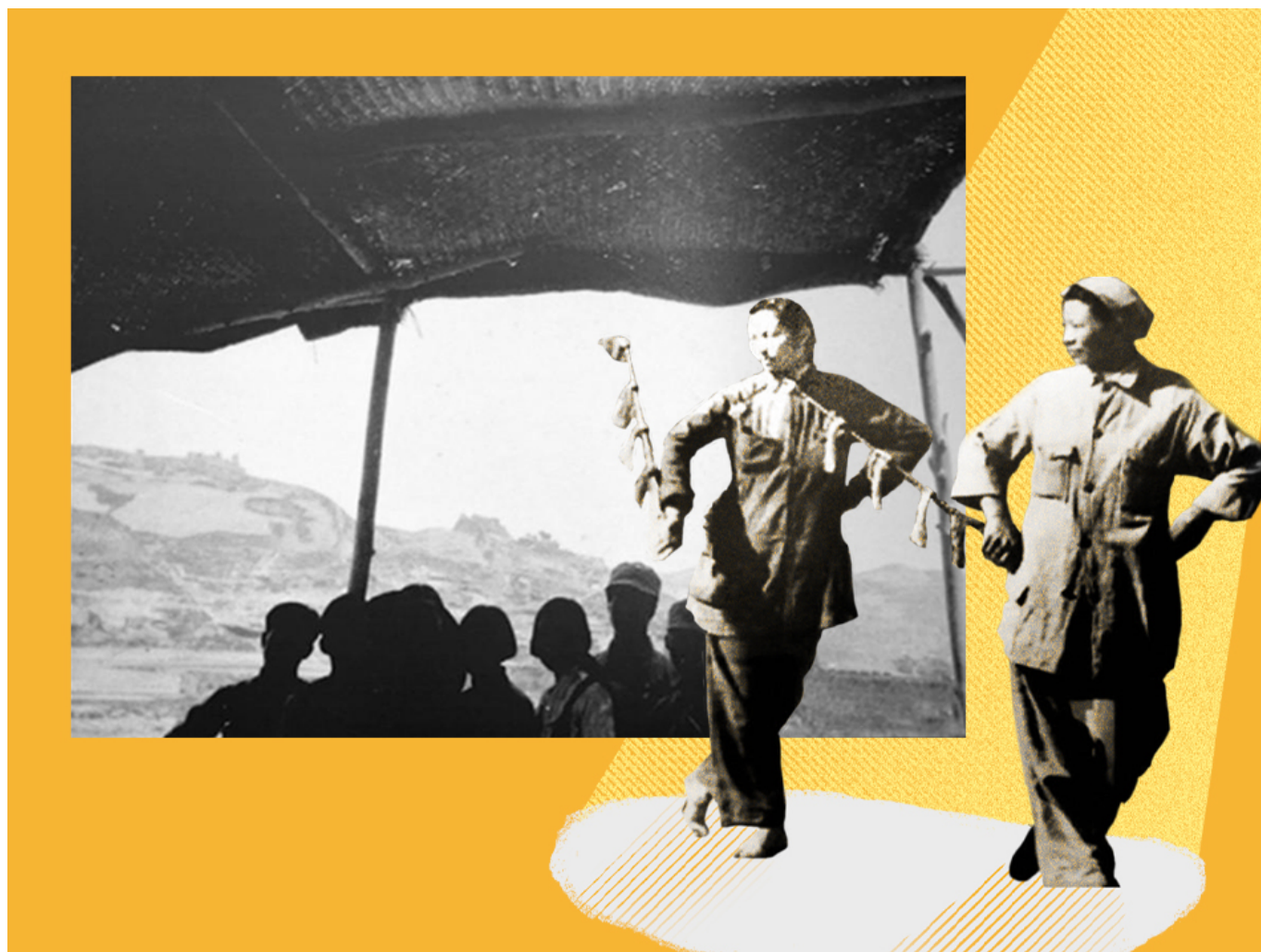
Front: Actors of a Beijing opera troupe perform. Back: Drama students of the Lu Xun Academy of Arts rehearse a play in a structure they built themselves.

The raid that Abu Aqleh was covering when she was killed took place in Jenin, the home of Palestine's remarkable Freedom Theatre . On 4 April 2011, Juliano Mer-Khamis, one of the theatre's founders, was shot dead not far from where Abu Aqleh was killed. 'Israel is destroying the neurological system of [Palestinian] society', Mer-Khamis said , and this neurological system 'is culture, identity, communication ... We have to stand up again on our feet', he said. 'We are now living on our knees'.